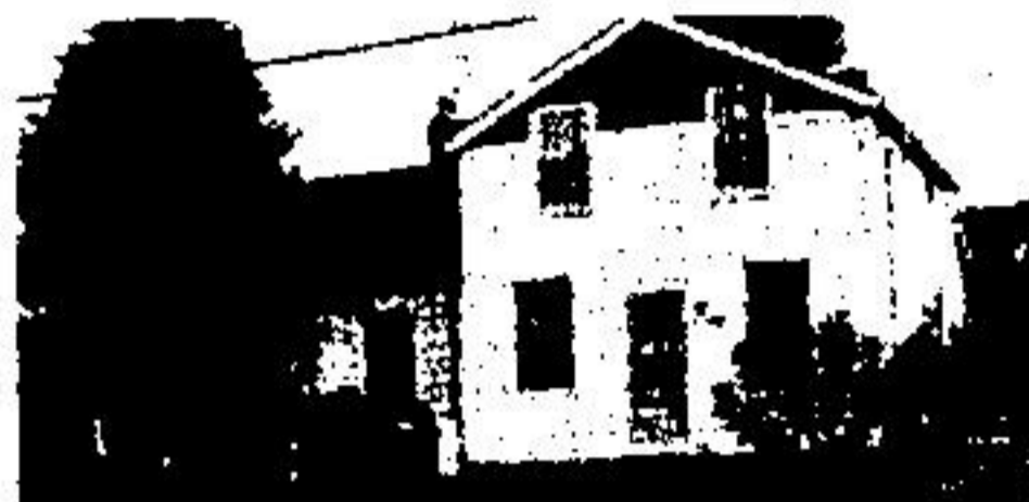
HILLSBURGH HOME PLUS INCOME

B.C. Redwood Cedar Home, 2200 sq. ft., 3 large bedrooms with 2-piece ensuite & walk-in closet. Very open — spacious concept with brick fireplace in centre on both levels. Large insulated, drywall garage with work area and mud room. Pond with cedar deck & beautiful landscaping. Asking $179,000.