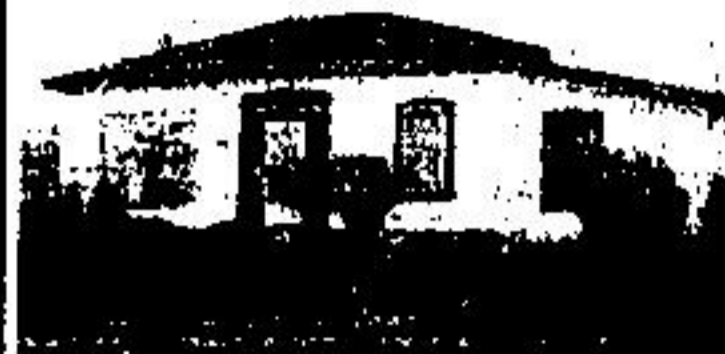
339' Deep Lot

If you like an older home but cannot afford to renovate it, come see this one. It has been well done inside — you'll fall in love with it the minute you open the front door... ready to move in tomorrow.