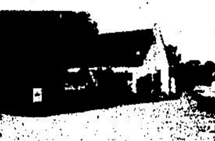
BACKING ONTO CREDIT RIVER

Beat the hard time; live in one apartment & rent out the other. Vendor will assist in the financing on this income producing duplex in the town of Erin.