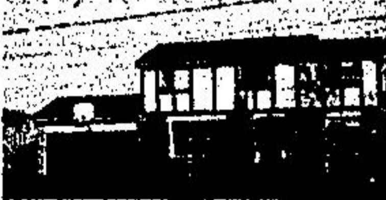
HAVINE PROPERTY - ONLY $114,900!

Lovely 3 bedroom home with large family room on approximately 1/2 acre in the village of Norval. There's a spacious one bedroom in-law suite, fenced, cement inground pool with large change house. Listed at $92,500.