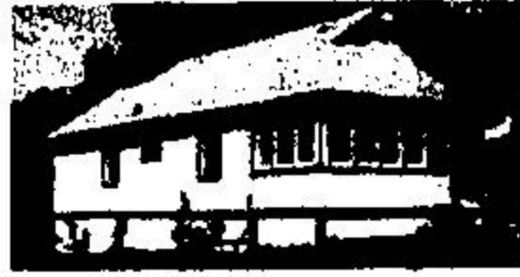
ATTENTION FIRST TIME BUYERS VENDOR MUST SELL FAST

Ideal starter or retirement home. This 3 bedroom semi-detached home has been protected with vinyl siding and aluminum soffits and is located on a quiet one-way street close to schools. The vendor will take back the first mortgage.