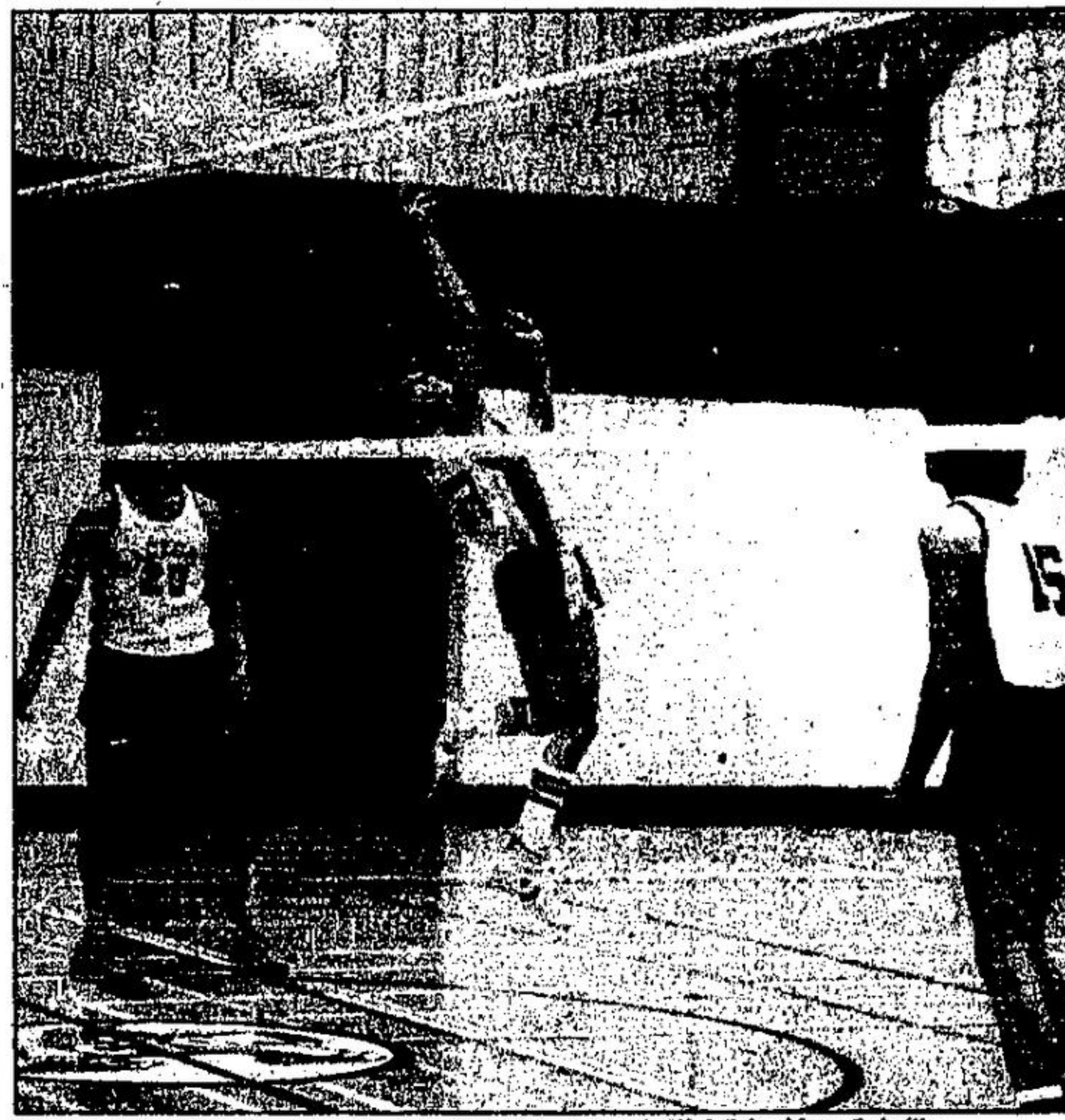
The Acton High School Junior Redmen Volleyball team dropped all three games at home last week to Loyola High School from Oakville.