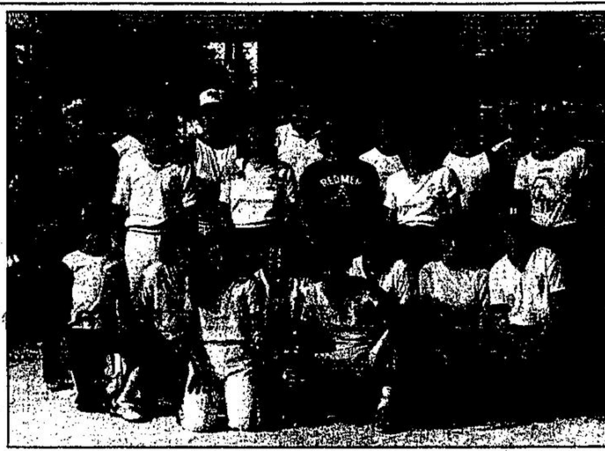
Acton High School Redmen Baseball team won the High School Baseball Tournament last Thursday when they defeated Bishop Macdonell High School from Guelph 4-3 in the final game of the tourney.