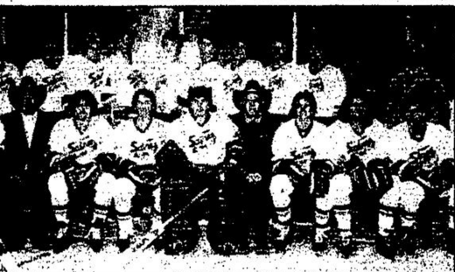
Acton Junior "B" Sabres 1982-83

The Acton Junior "B" Sabres improved their record over the weekend to two wins, one loss, after defeating the Burlington Cougars and the Georgetown Gemini by identical scores 8-5.