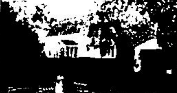
NOW - $72,000.

How about an in town lot with 175 foot depth. The home? Fireplace in living room, close to 1300 square ft. Formal dining area. Pleasant cedar siding home. Peter Thornton.