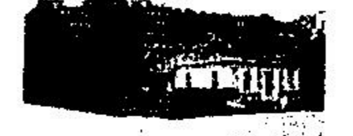
CUTE AS A BUTTON.

Has 3 bedrooms, fenced yard, 2 bathrooms, walkout from lower level. Quality broadloom, garage plus many other fine features.