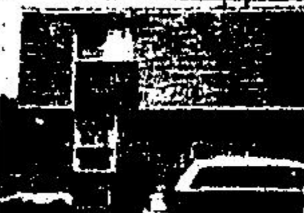
ACTON CONDOMINIUM. $40,900.

Immaculate throughout, quality broadloom, walkout from living room, 2 bathrooms plus much more. Call Damian Nikic.