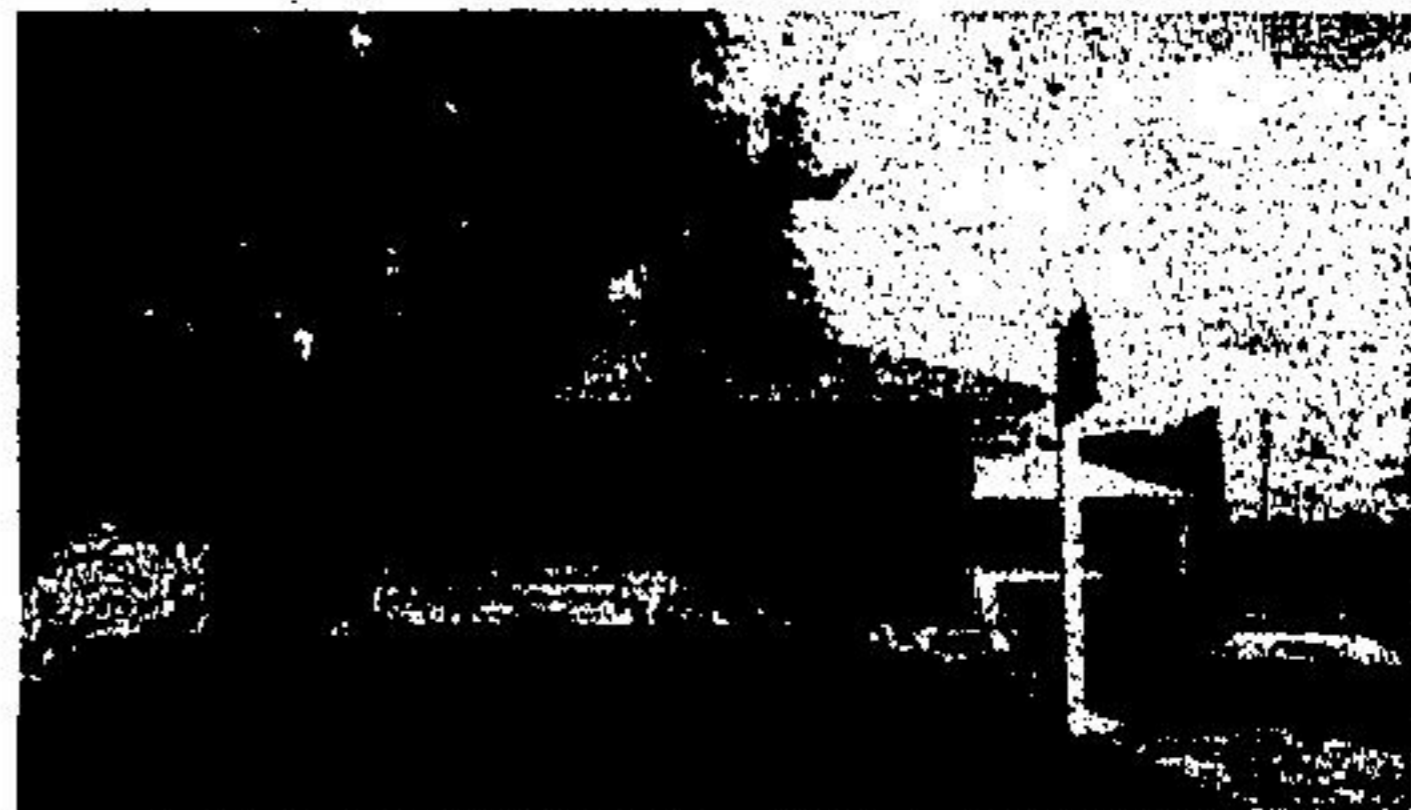
ASKING ONLY $69,900

New kitchen, new bathroom, finished rec room with airtight stove and supply of wood to last you most winter. Vacant - immediate possession. Call me today to inspect.