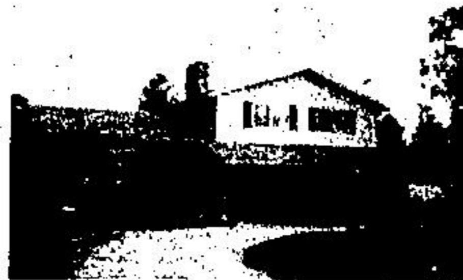
1/2 ACRE - POOL

New kitchen, new bathroom, finished rec room with airtight stove and supply of wood to last you most winter. Vacant - immediate possession. Call me today to inspect.