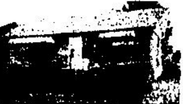
PRICE IS RIGHT $66,900

Immaculate throughout, quality broadloom, walkout from living room, 2 bathrooms plus much more. Call Damian Nikic.