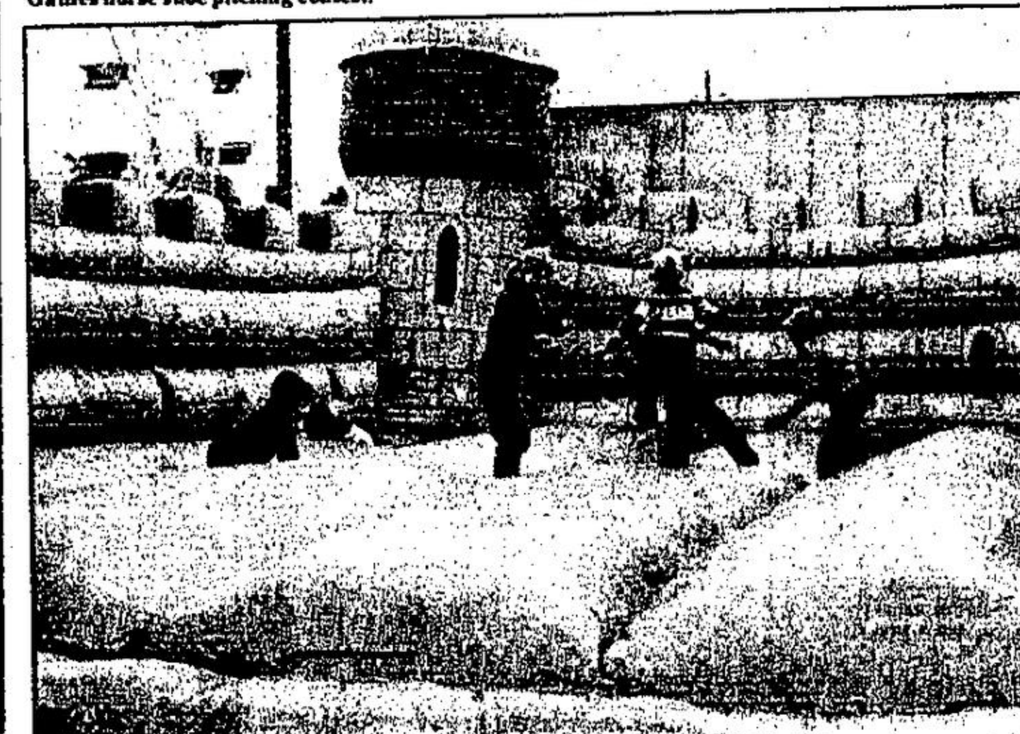
Bouncing in the castle was a midway treat for children.