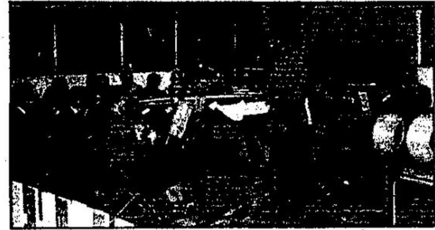
Acton Citizens' Band performed before the Friday evening show.