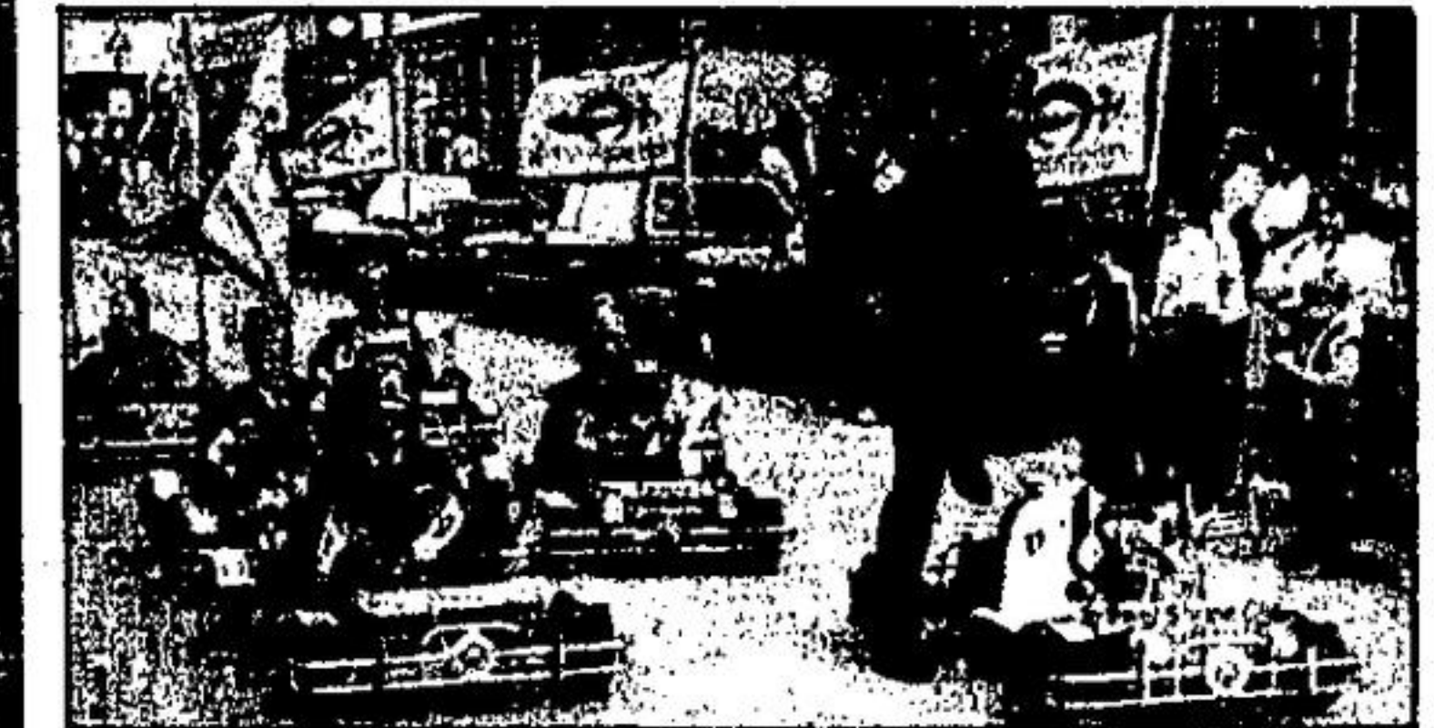
The Peel Shriners cart patrol was a big parade hit.