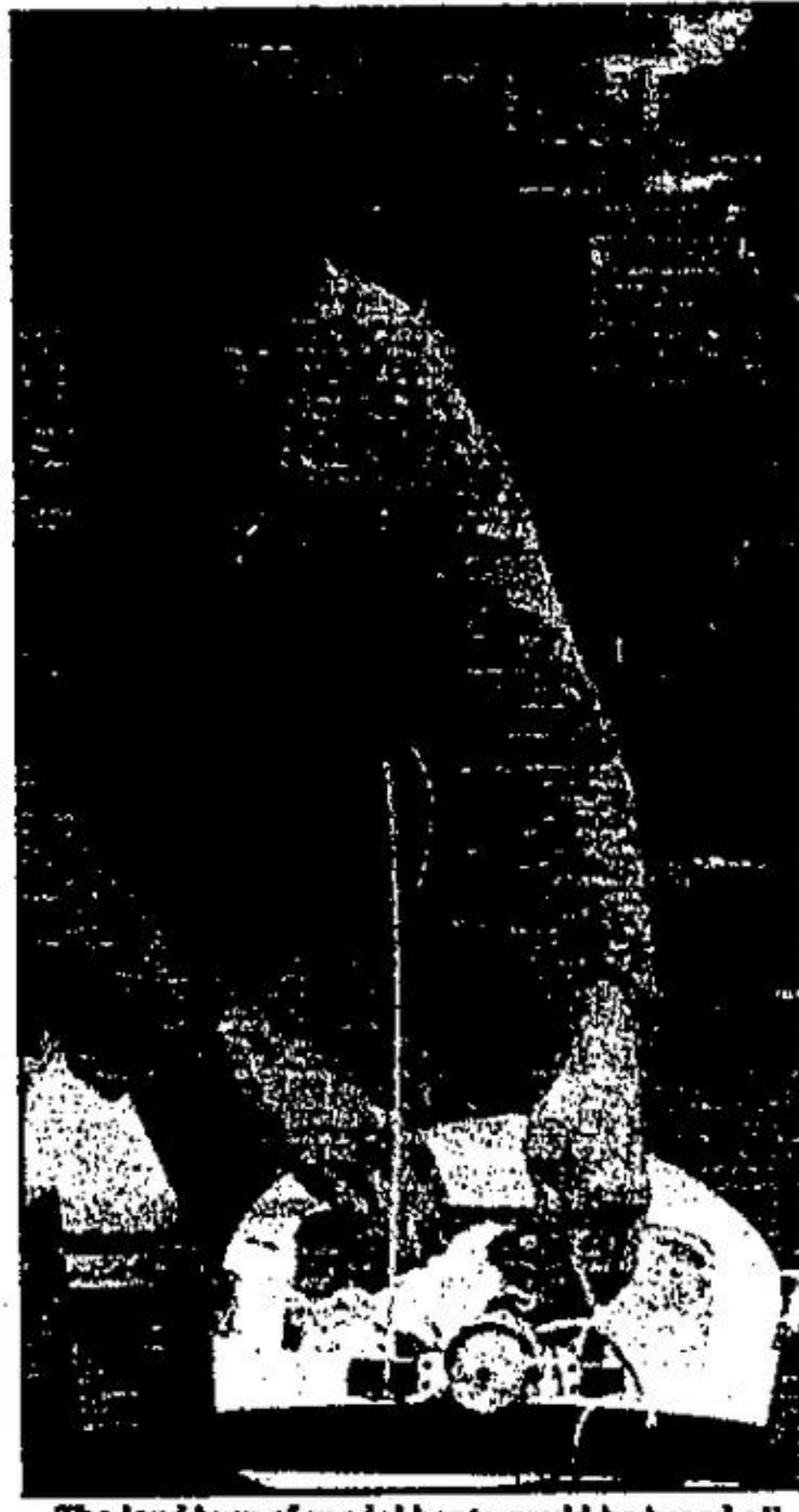
The loud hum of model boats could be heard all over the park on Saturday and Sunday.