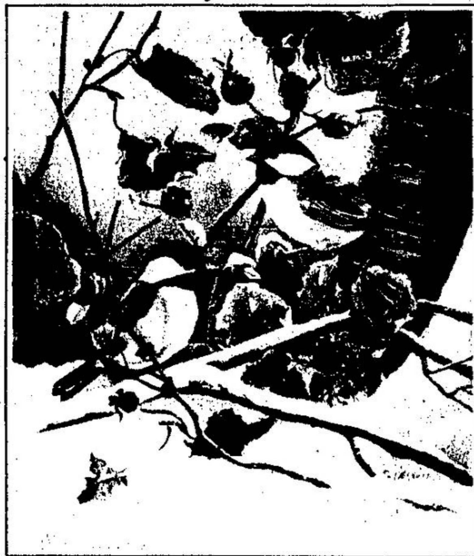
WINTER CHICKADEES by Shirley Deaville 500 sq ft 14 1/2" x 17 1/2" $75.00 Shirley is a native of Georgetown, Ontario