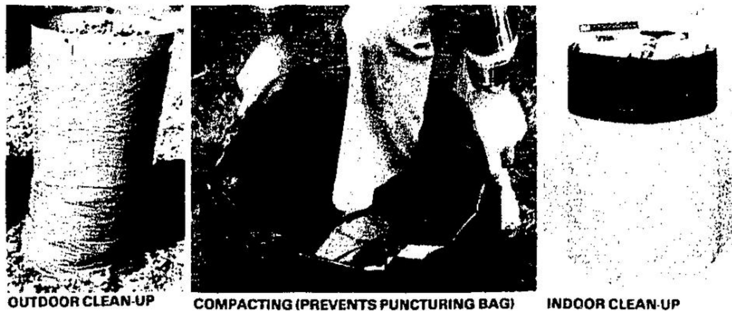
OUTDOOR CLEAN-UP COMPACTING (PREVENTS PUNCTURING BAG) INDOOR CLEAN-UP

THE ONLY FULLY ADJUSTABLE GARBAGE BAG HOLDER!