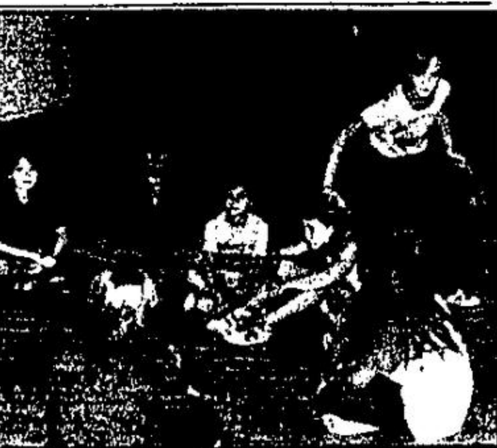
Last week at the Rockwood Day Camp these youngsters were playing the game called maybe, maybe not.

by Doris Flies Workmen are laboring against time at Ospringe school these days. As they have done in many other schools, the maintenance crew from the Wellington County Board of Education, are bricking up the huge windows that seemed to take up most of the outside walls. When completed there will be three smaller windows in each classroom. The main purpose of this, I was told, is to conserve heating. A lot of cold air comes seeping in around those big windows. It will also cut down on vandalism. Hundreds of dollars have been spent by the Board of Education each year, keeping windows replaced in all the schools in the county. As an afterthought I was informed it would be less windows for the caretaker to clean. Now why didn't they think of that years ago. There is still a lot of work to be accomplished before Ospringe school re-opens in September, so here's hoping