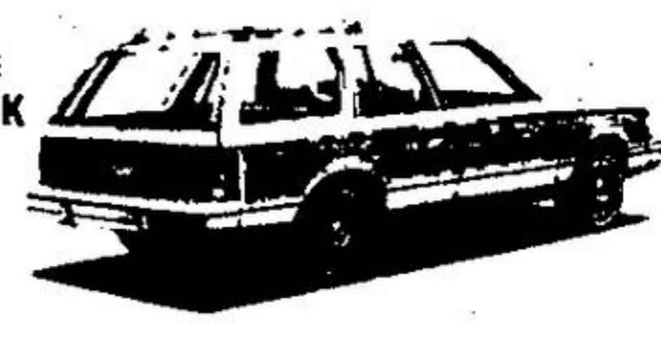
1982 DODGE ARIES K