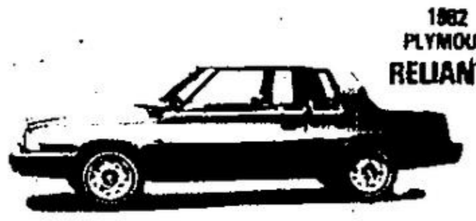
1982 PLYMOUTH RELIANT K