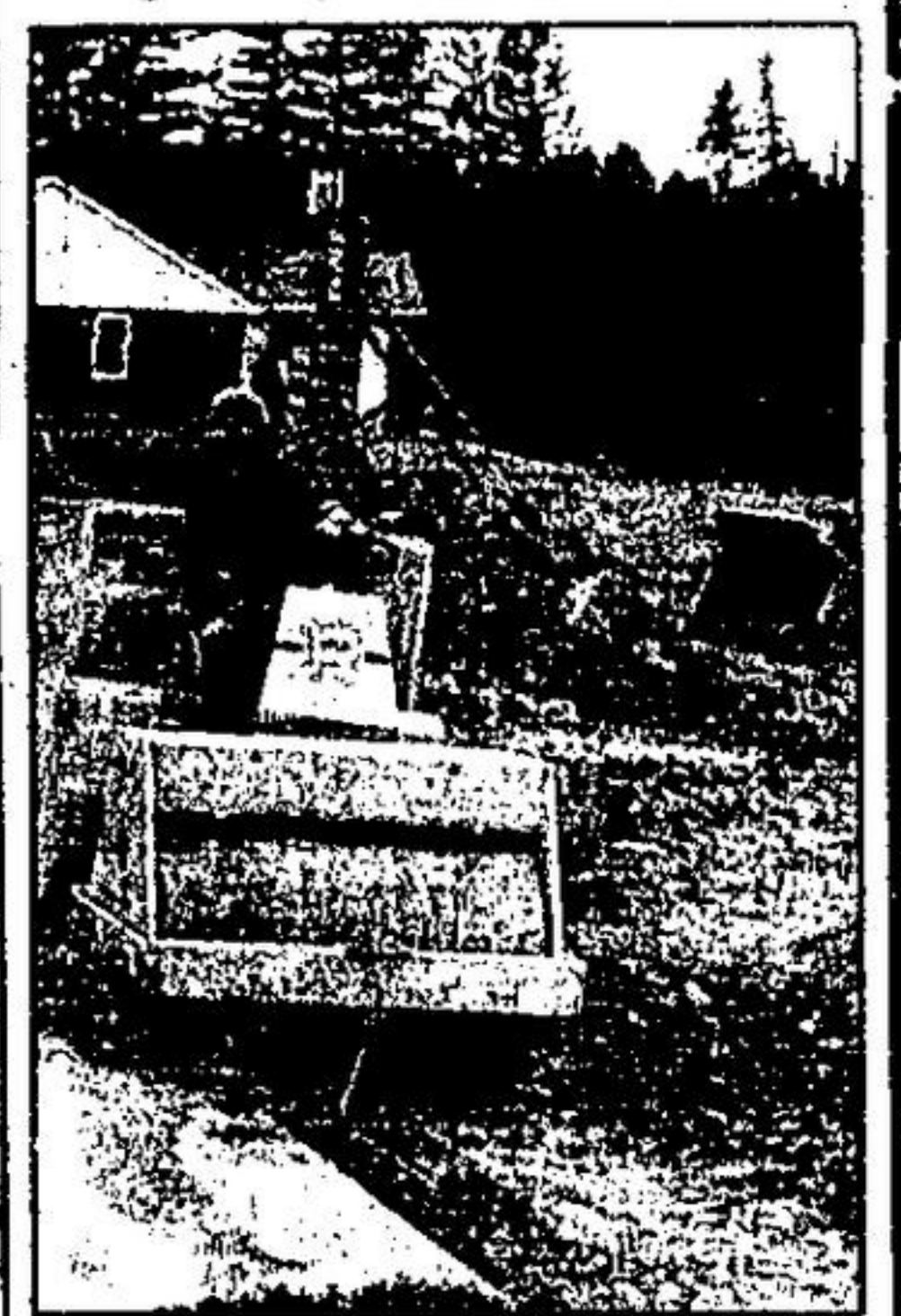
The big roller pounds down the ground as work on the grounds at Acton's new school is under way.