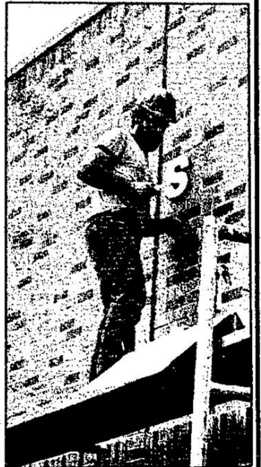
A workman drills holes through the pattern for the St. Joseph's School name which went on the building Thursday.