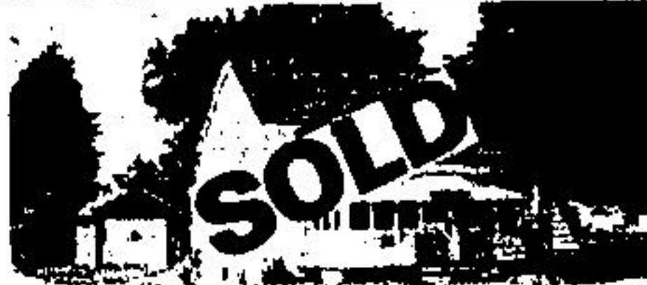
VILLAGE OF HILLSBURGH

$55,500. — Cute little brick bungalow, 3 bedrooms, living room, eat-in kitchen, 4 pc. bath. Full basement. Large treed lot. Vendor will consider mortgage.