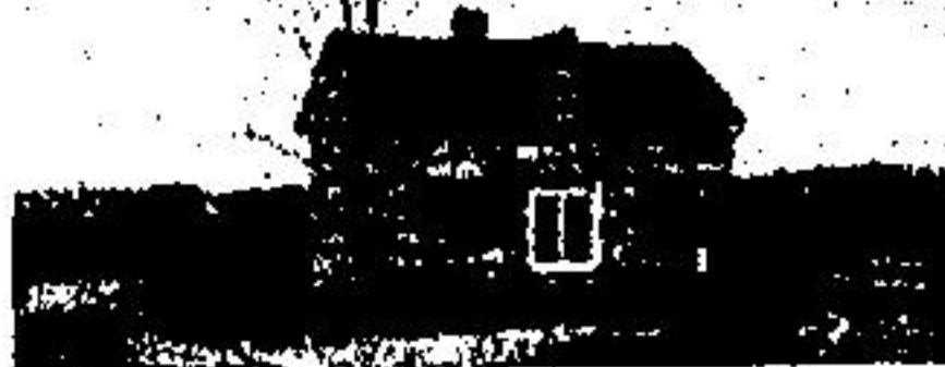
RETREAT — STONE

94 acre rolling hillside, overlooking west Credit river and valley. One and a half storey stone, renovated interior, 3 bedrooms, kitchen, living room, study, new hot water heating system, fireplace. Nicely set back from road. Easy commuting. Just north of Georgetown. Asking $198,000.