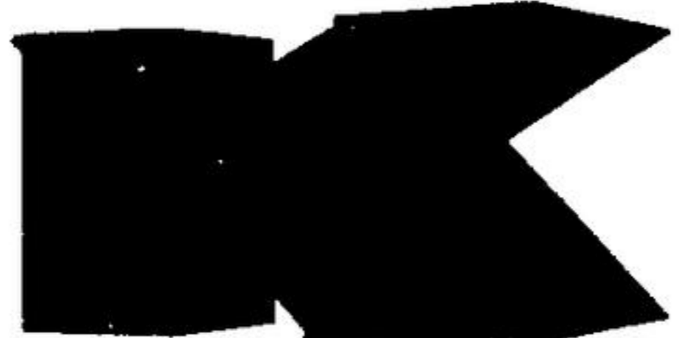
1982 DODGE ARIES K