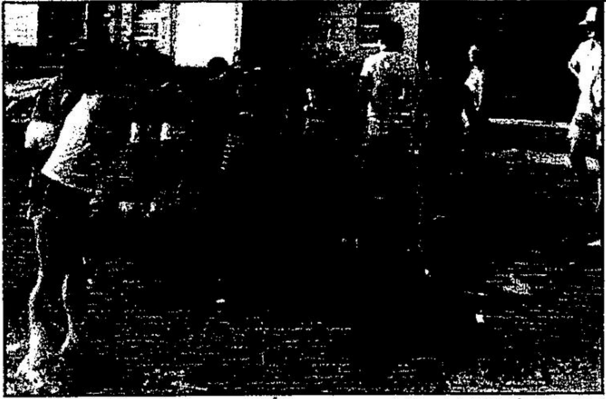
Greenore Cres. residents enjoyed a balloon toss on the street at the block party held Saturday.