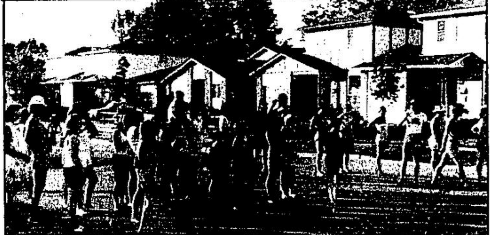
Greenore Cres. residents played Simon Says on the street at their block party Saturday.