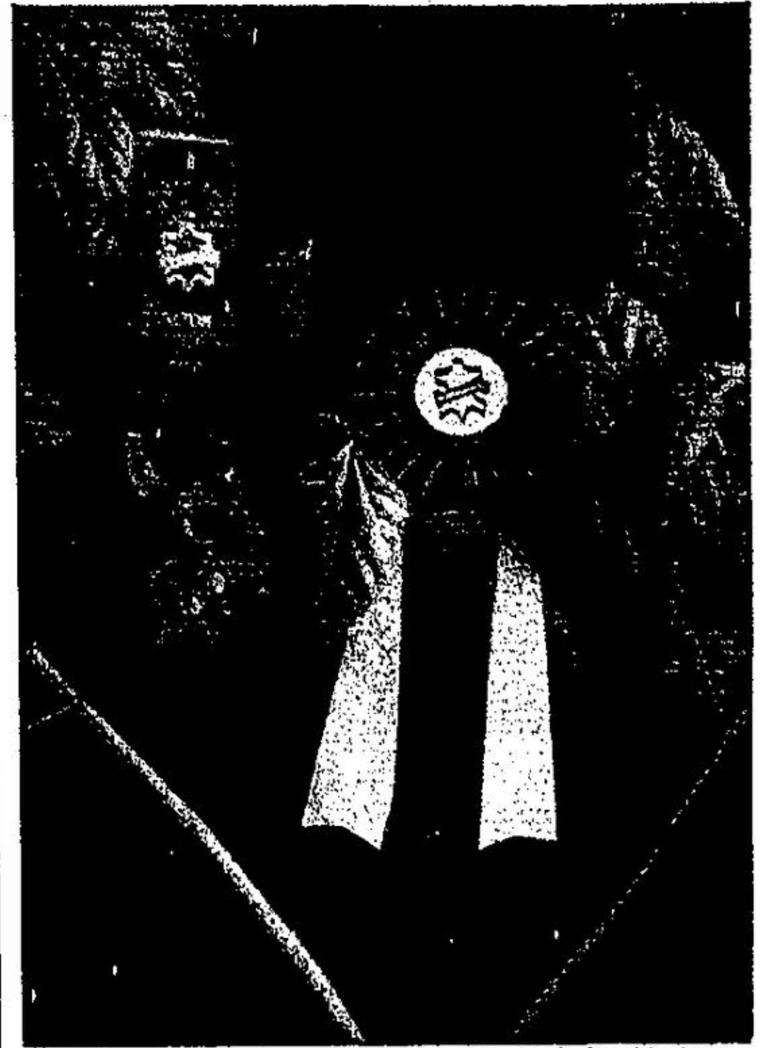
Getting into Acton's Leathertown theme, the Acton Agricultural Society has this year adopted the Leathertown logo which will be proudly displayed in the centre of their new ribbons. Plans are now finalizing for the three day fair, September 17, 18 and 19.