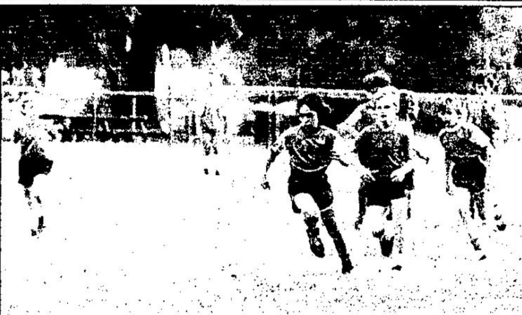
Squirt soccer action was furious last Wednesday night at Prospect Park. Acton defeated Rockwood 10-1.