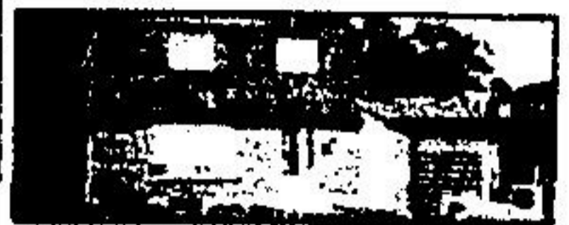
BUY RIGHT - RIGHT NOW!

Tastefully decorated townhouse, 3 bedrooms, 2 washrooms, private yard and private drive. Call Fred Harrison.