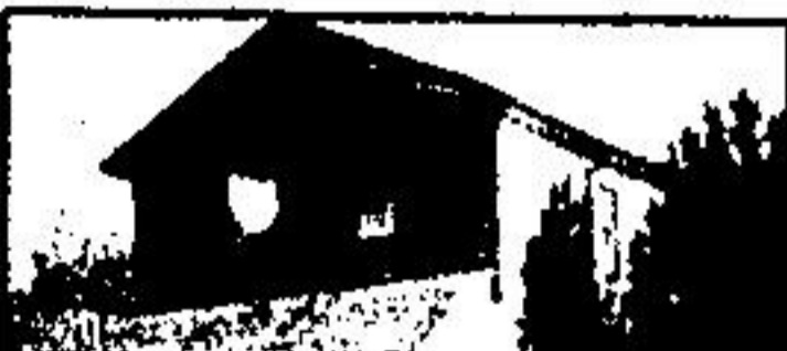
HOME & BUSINESS $99,500

Huge steel barn, cement floor - 1/2 acre lot comes with this 4 bedroom brick home - 3 washrooms, main floor family room, super rec room, separate dining room. Vendor will hold mortgage. Call Mike Adams.