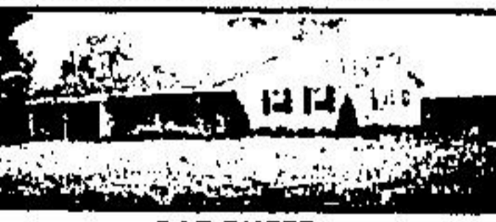
CAR BUFFS -

3 bedroom bungalow, large family room, fireplace, formal dining room, patio and small barn on 1/2 acre. Call Sandra Nairn.