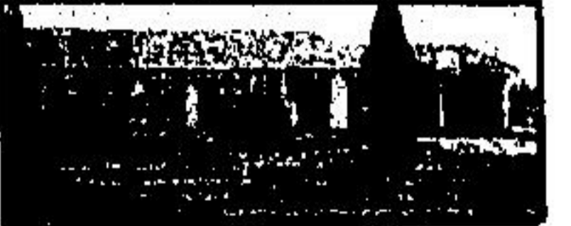
FRESH AIR & SPACE TO ENJOY IT

Thick quality carpet even in the rec room in this immaculate home, crescent location, 1/2 fenced acre, ideal lot for pool, many extras, try an offer. Asking $109,900. Call Ann McIntyre.