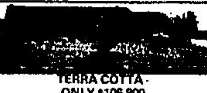
TERRA COTTA - ONLY $106,900

Well constructed brick bungalow, circular drive, 2 baths, fireplace, rec room, large deck off modern kitchen, good financing. Reduced to $87,900. Details from Ann McIntyre.