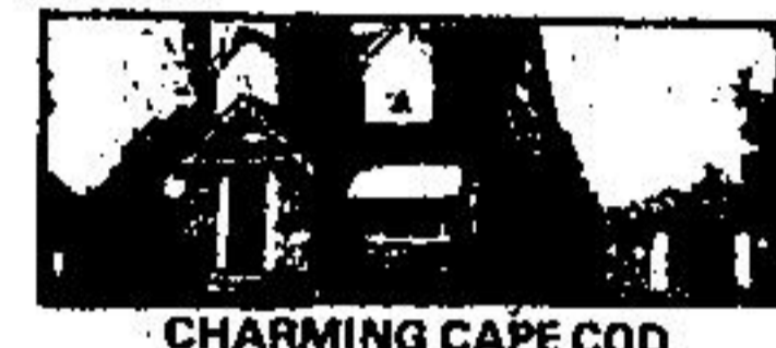
CHARMING CAPE COD

Nearly new custom rancher in quiet country setting. Master bedroom has 3 piece ensuite, kitchen with built-ins, fireplace, broadloom, 2 car garage, plus more. Details from Joyce VanDelinder.