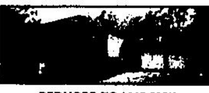
REDUCED TO $119,900!!

Classic home with 7 very spacious rooms, 3 baths, 2 fireplaces, country kitchen and main floor family room, 1/2 acre with mature trees. Asking $106,000. Call Ann McIntyre.