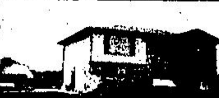
REDUCED $10,000. IDEAL FOR HORSE LOVERS

Lovely 3 bedroom brick home, large formal dining, covered patio, many mature trees, large lot, only $87,900. Call Sandra Nairn.