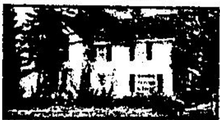
ANTIQUE LOVERS PARADISE

3 bedroom brick bungalow plus kennel facilities with block heated building and 20 mins. Vendor anxious. $87,900. Call Joyce VanDelinder.