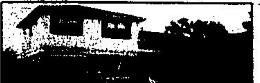
PRICED FOR A QUICK SALE

Quality aluminum and brick exterior with aluminum trims, excellent floor plan, quality windows, superb location, finished basement. Vendor assisted financing. Asking $83,900. Details from Ann McIntyre.