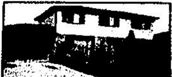
THE ULTIMATE HOUSE & AREA

So much value in this 5 bedroom home, gorgeous setting amidst trees, stream and pond in The Park. Call Joanne Ukos.