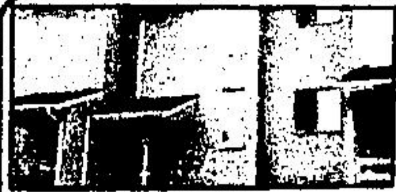
REDUCED - $67,500.

Tastefully decorated townhouse, 3 bedrooms, 2 washrooms, private yard and private drive. Call Fred Harrison.