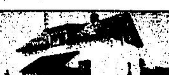
GREAT BUY - $68,900.

Reduced to $449,000. Spacious rancher, beautifully finished, 3 fireplaces, formal living & dining rooms, huge family room, master with dressing room plus many extras, pond & barn. Call Joyce VanDelinder.