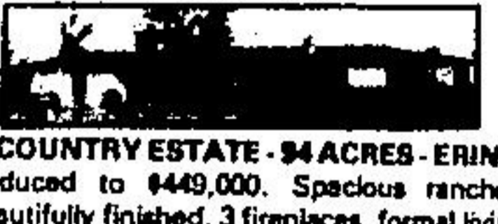
COUNTRY ESTATE - 34 ACRES - ERIN

Executive 4 bedroom in prestigious area of Georgetown. Main floor family room with fireplace, spacious living and dining area, main floor laundry plus completely finished walkout basement to private lot backing onto woods. Call Joyce VanDelinder.