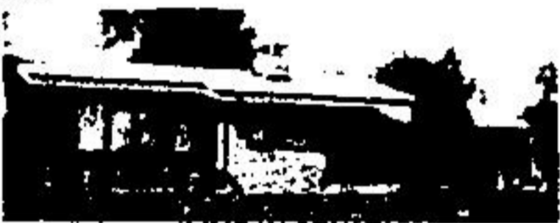
LIVE IN STYLE!