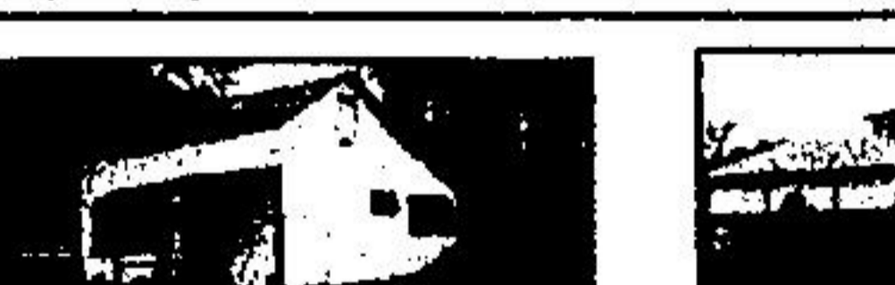
GREAT STARTER - EXCELLENT MORTGAGE

Custom built beauty, formal living & dining rooms, rec room, fireplace, almost 1 acre Brampton area. Call Tillie Harvey or Cathy Dodds.