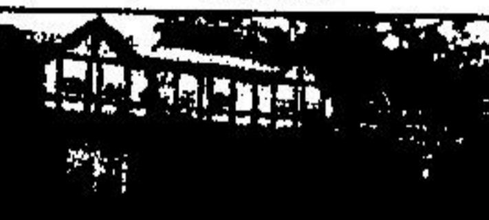
LOVE AT FIRST SIGHT $154,900.

10 acres just minutes to Hwy. 7 - 2 year old raised bungalow finished to perfection, fireplace in walkout family room, 2 baths, inground pool, 5 stall barn & paddocks. $149,900. Joyce VanDelinder.