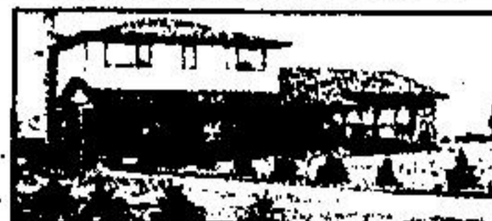
COUNTRY EXECUTIVE - CLOSE TO STEELES AVE.

Custom bungalow, 3 large bedrooms, main floor family room - top quality materials throughout. Very private area. Call Mike Adams for all the details.