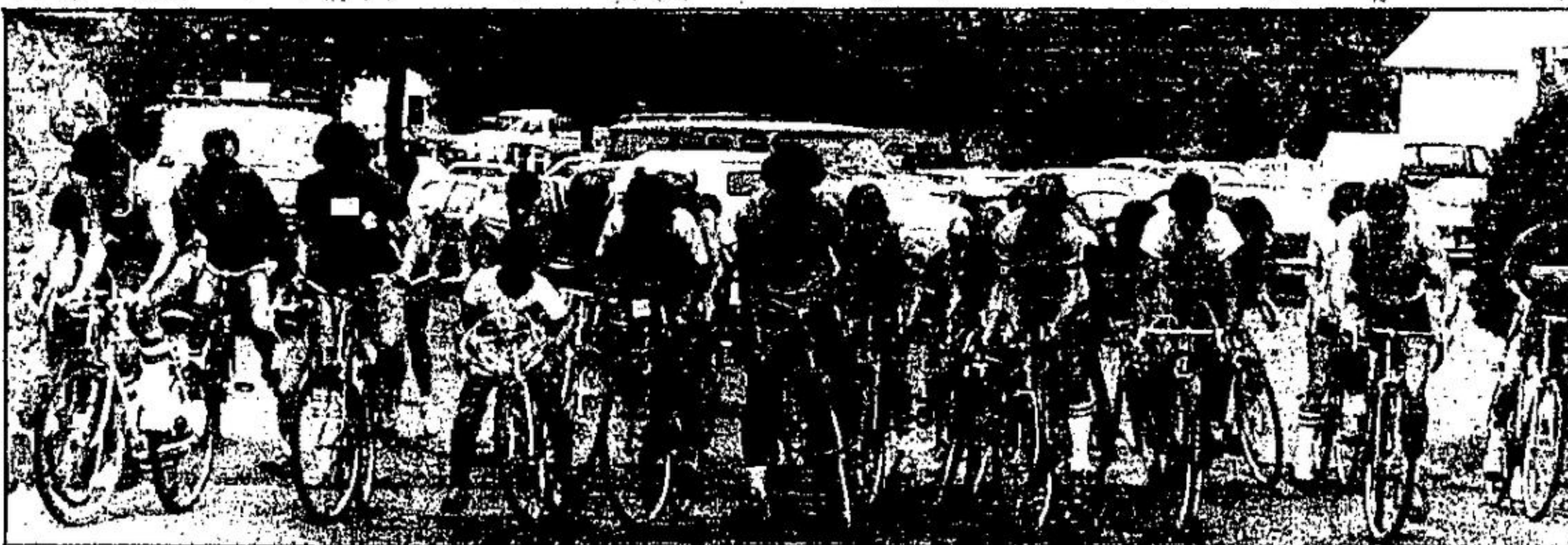
The bikers begin to roll out of the park Sunday morning at the Y's Men's annual Blathlon.