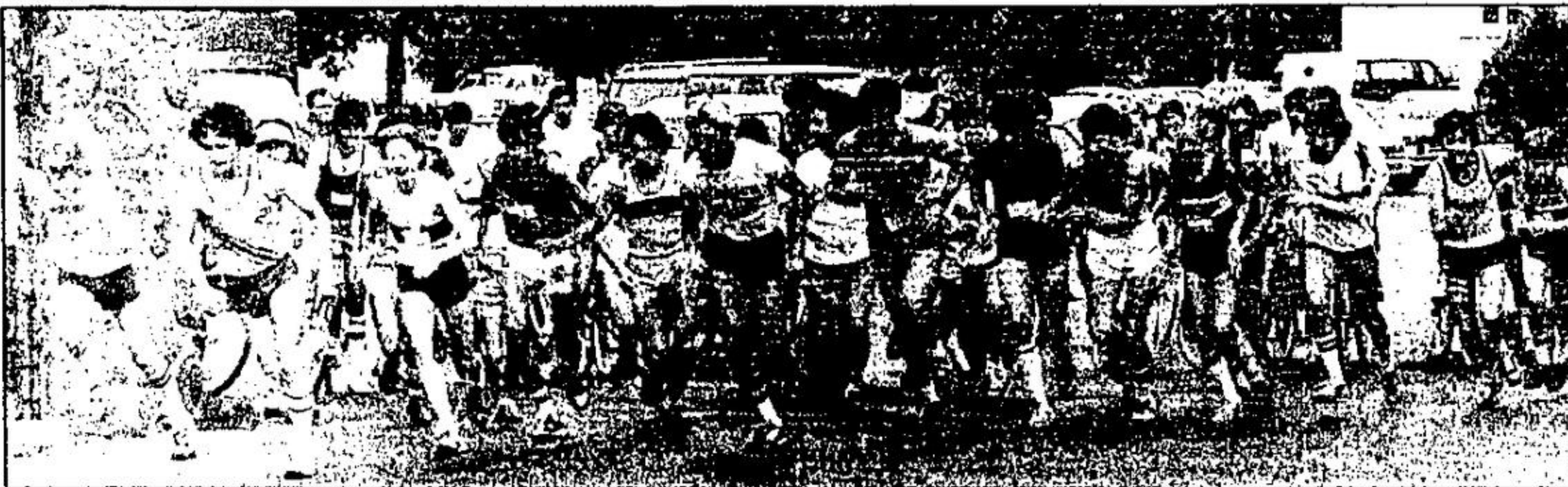
The runners begin at the park gates Sunday morning at the annual Y's Men's Blathlon.

INDUSTRIAL BALL There were no game reports handed in by press time for the Acton Industrial Baseball League.