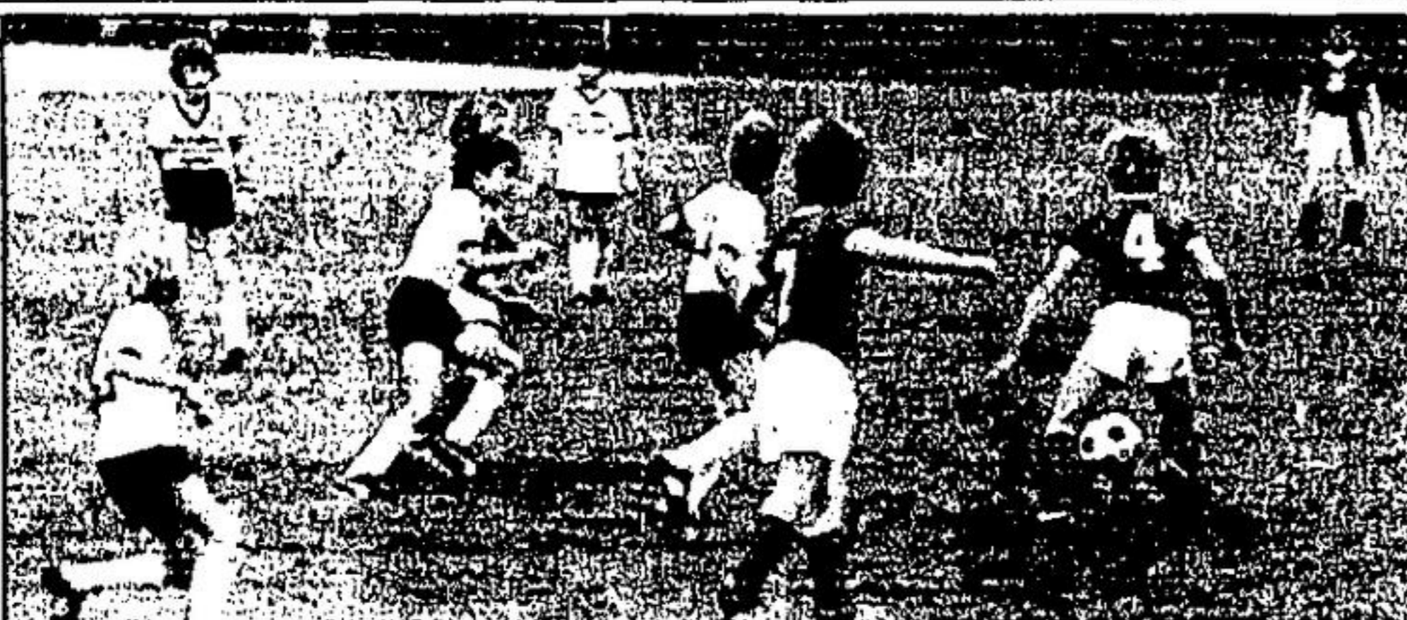
Minor soccer action Saturday at McKenzie-Smith Middle School Milton defeated Acton 2-0.

Sunday July 4—9 a.m. Electric vs. Furniture (M); 10.30 a.m. Bears vs. Station (M); 12 noon Ladies Semi-Final (L); 1.30 p.m. Electric vs. Industrials (M); 3 p.m. Furniture vs. Station (M); 4.30 p.m. Ladies Final (L); 6.30 p.m. Men's Final (M); (M) Men's Games (L) Ladies Games.