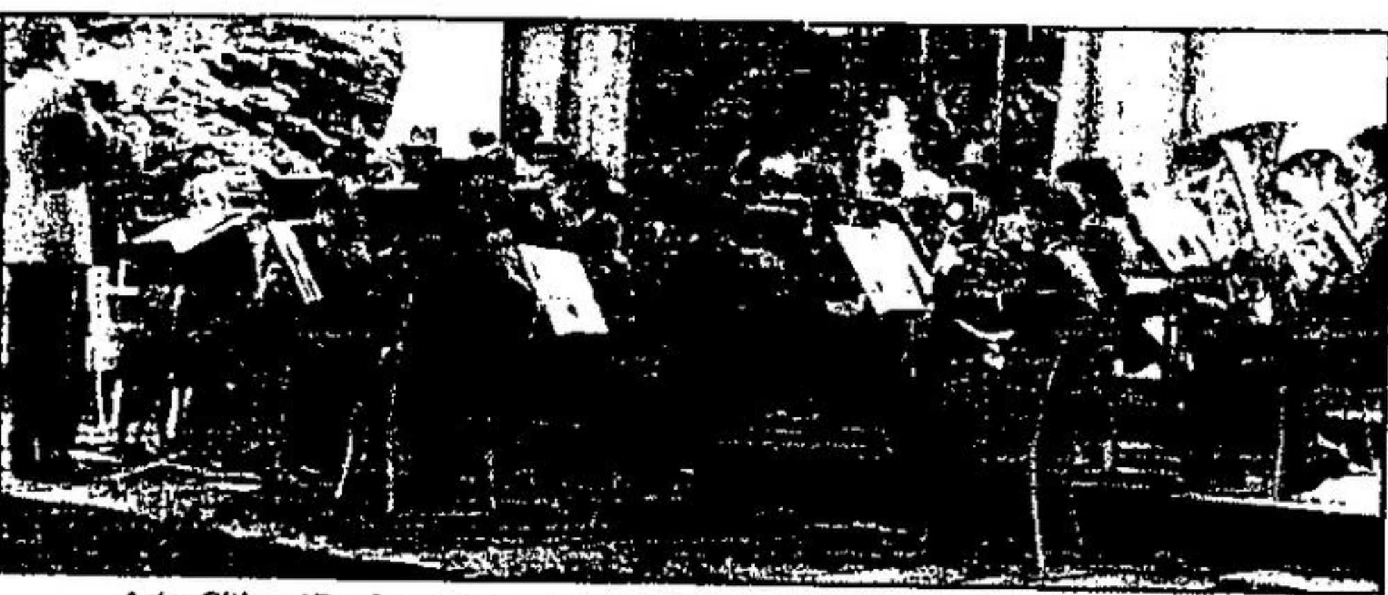
Acton Citizens' Band gave its annual Supper Concert Sunday evening at the Band Hall.