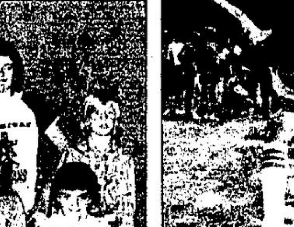
North Halton Finals at Acton High School last Thursday.