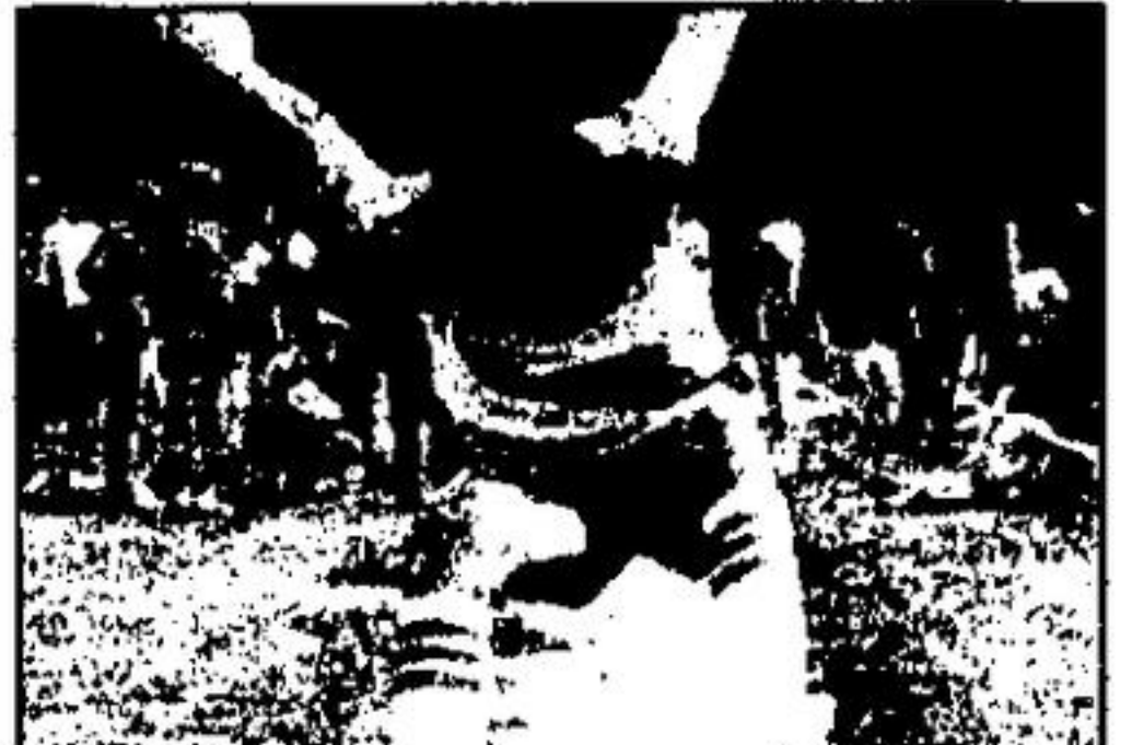
North Halton Finals at Acton High School last Thursday.