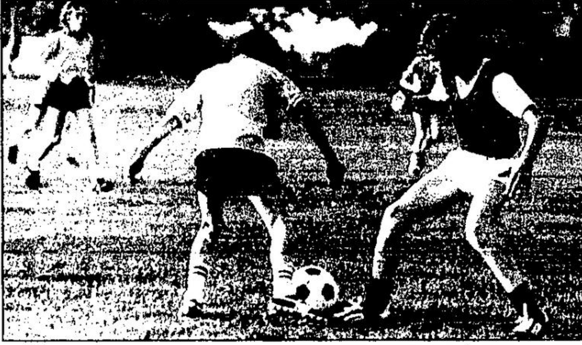
Minor Soccer action last Wednesday at McKenzie-Smith Middle School.

Redmen Rugger Last week all the Acton High School Redmen Rugger Teams were eliminated from the play-offs as the Midgets lost in the semi-finals to Oakville-Trafalgar 24-0. The Juniors were hammered in the quarter-finals 43-0 by Oakville-Trafalgar and the Seniors were defeated 18-3 in the quarter-finals by Bramalea. This ends the rugger season until next year.