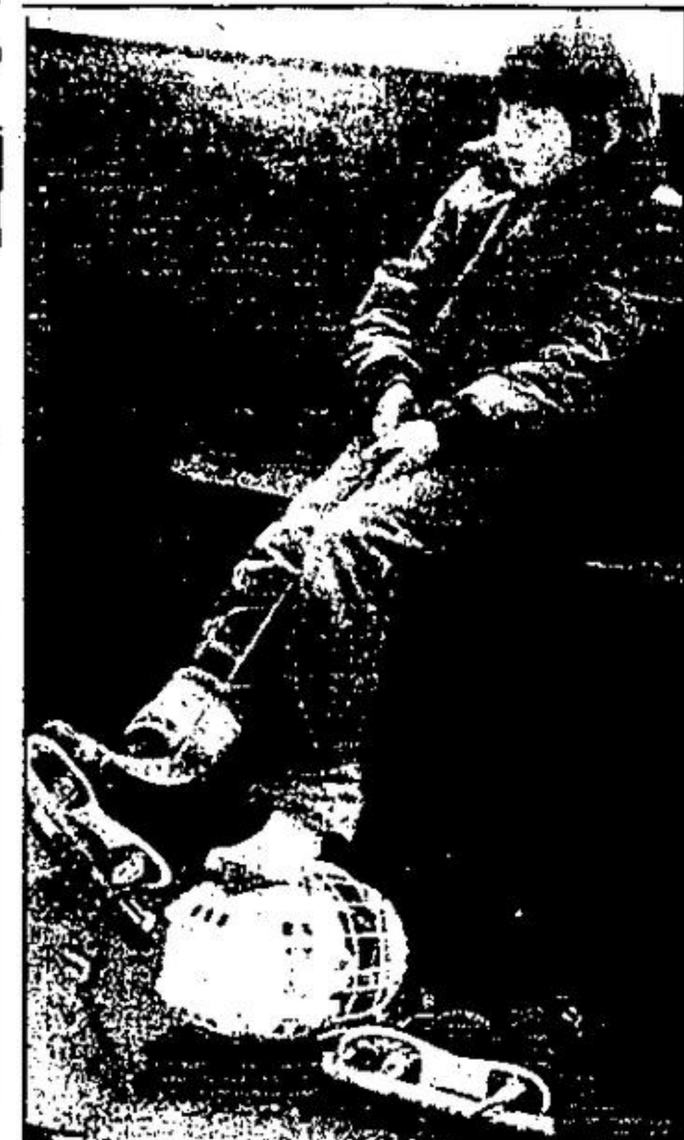
Jason Medland ties up skates for Power Skating.