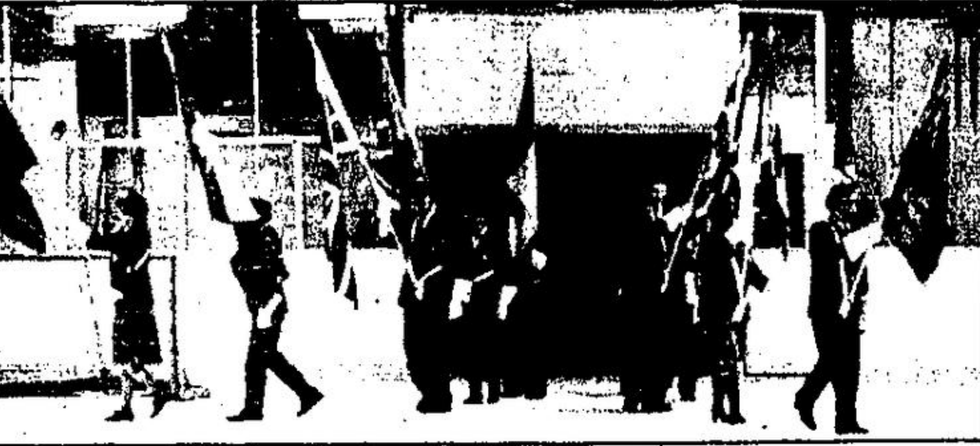
Opening ceremonies were conducted by members of the Acton Legion Branch 197.