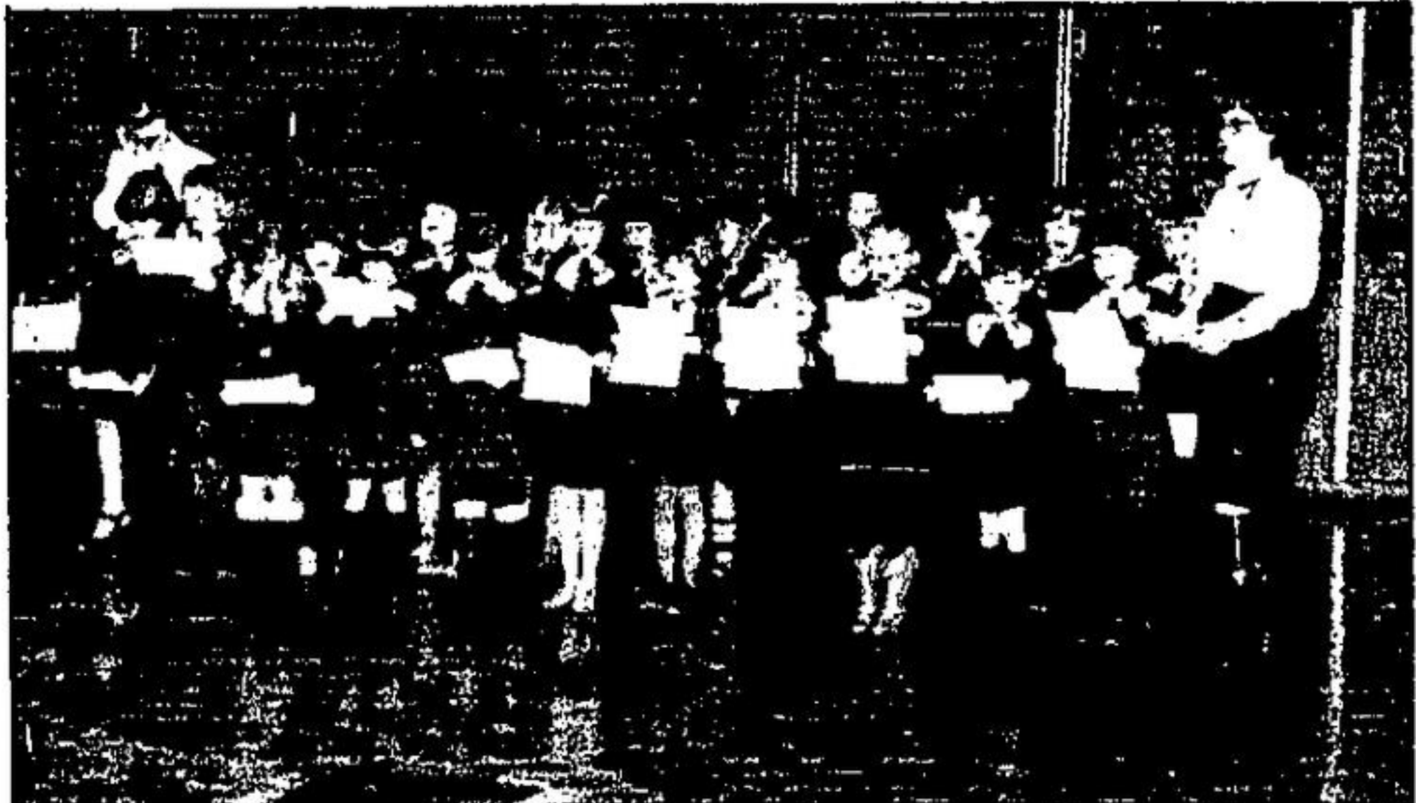
Various Brownie and Guide groups entertained during their annual banquet at the Legion Thursday evening.