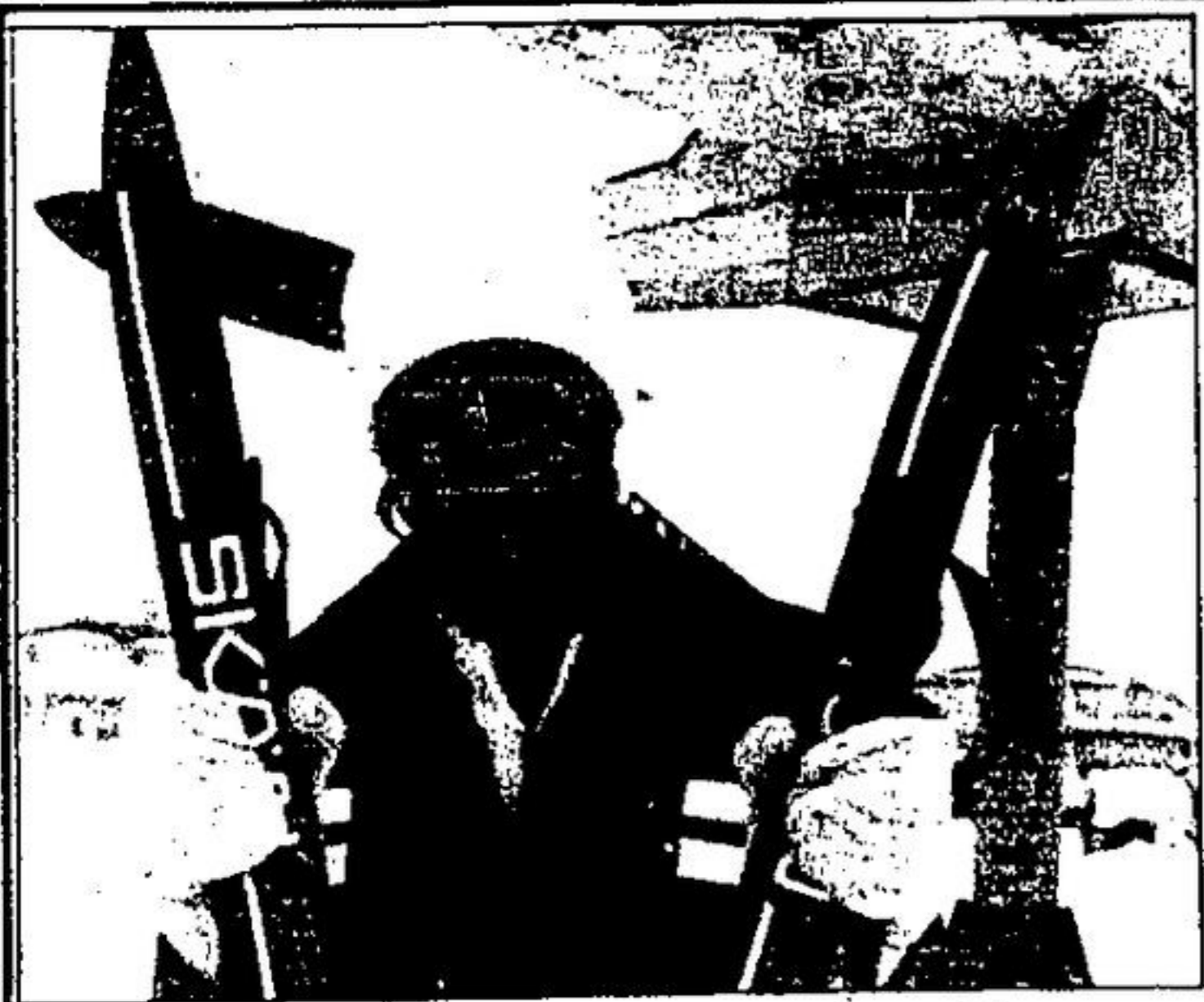
Elly Vandermeer is already for an afternoon of cross country skiing.