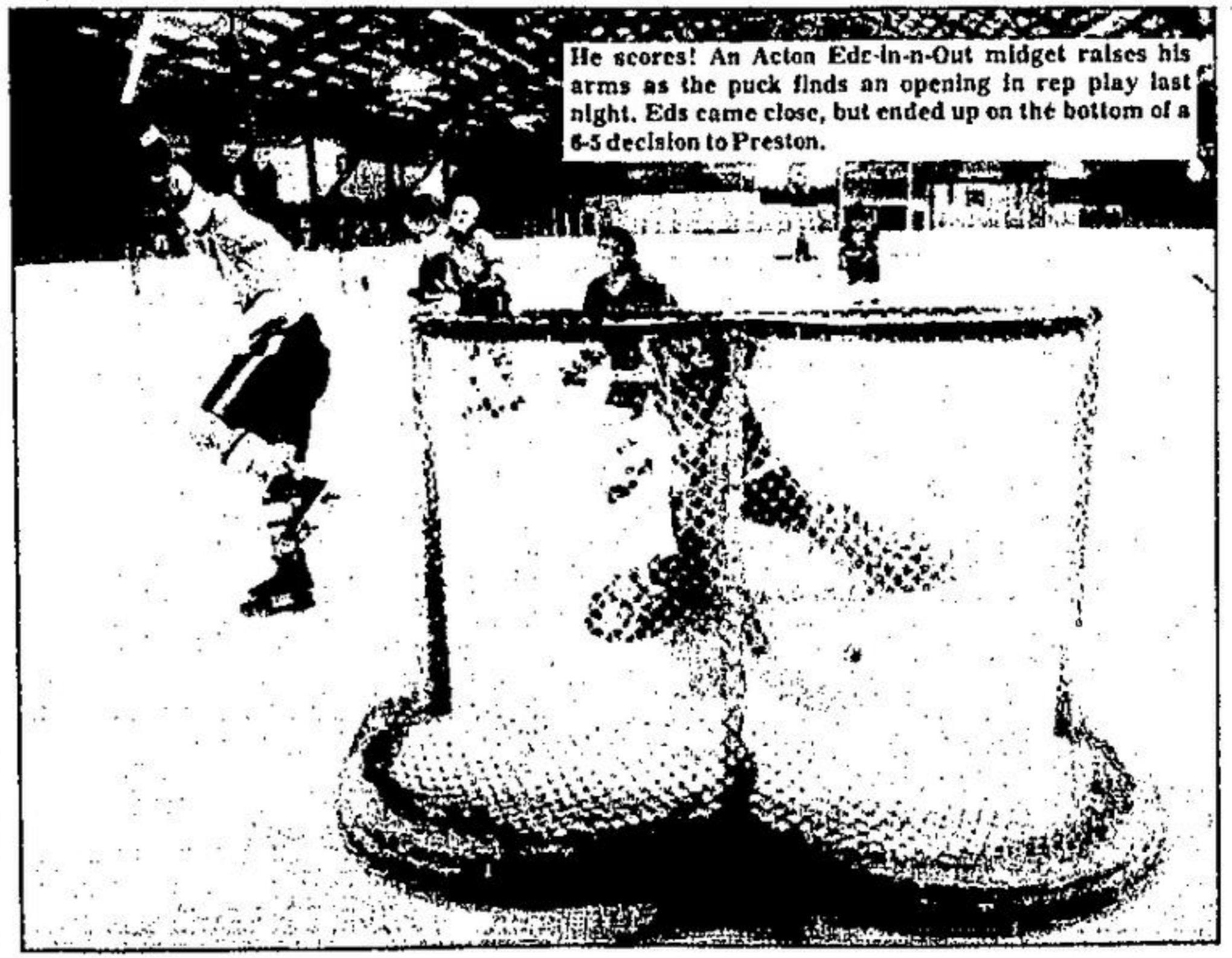
He scores! An Acton Ed's-In-and-Out midget raises his arms as the puck finds an opening in rep play last night. Eds came close, but ended up on the bottom of a 6-5 decision to Preston.