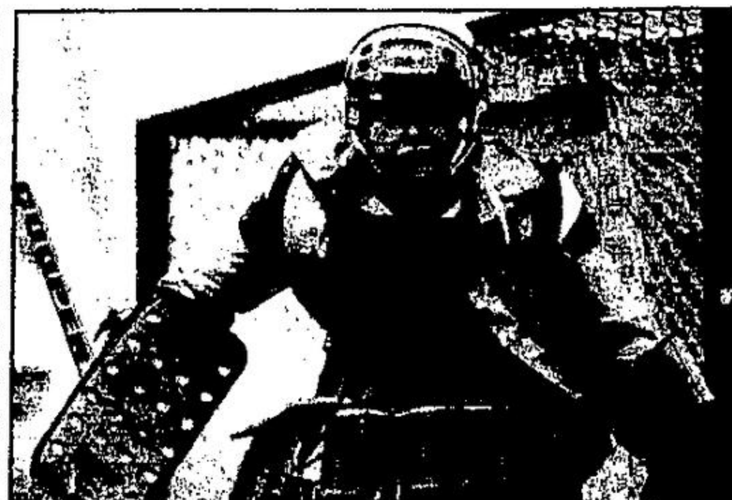
One of the budding stars of Legion house league hockey show his form on the Branch 197 float.