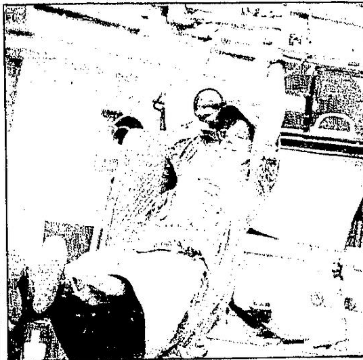
The parade was a swinging affair.