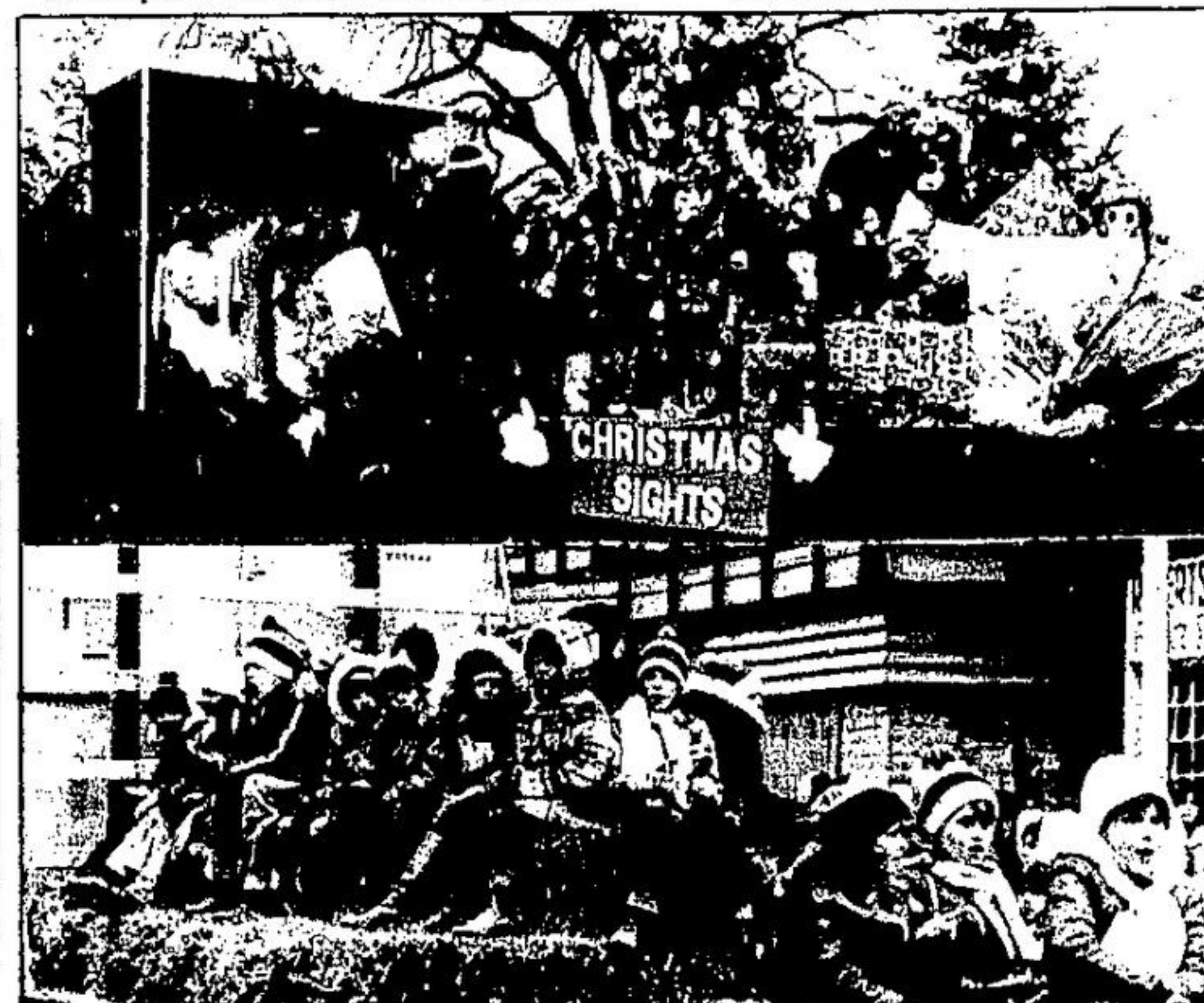
The sights and sounds of Christmas as Robert Little School sees them.