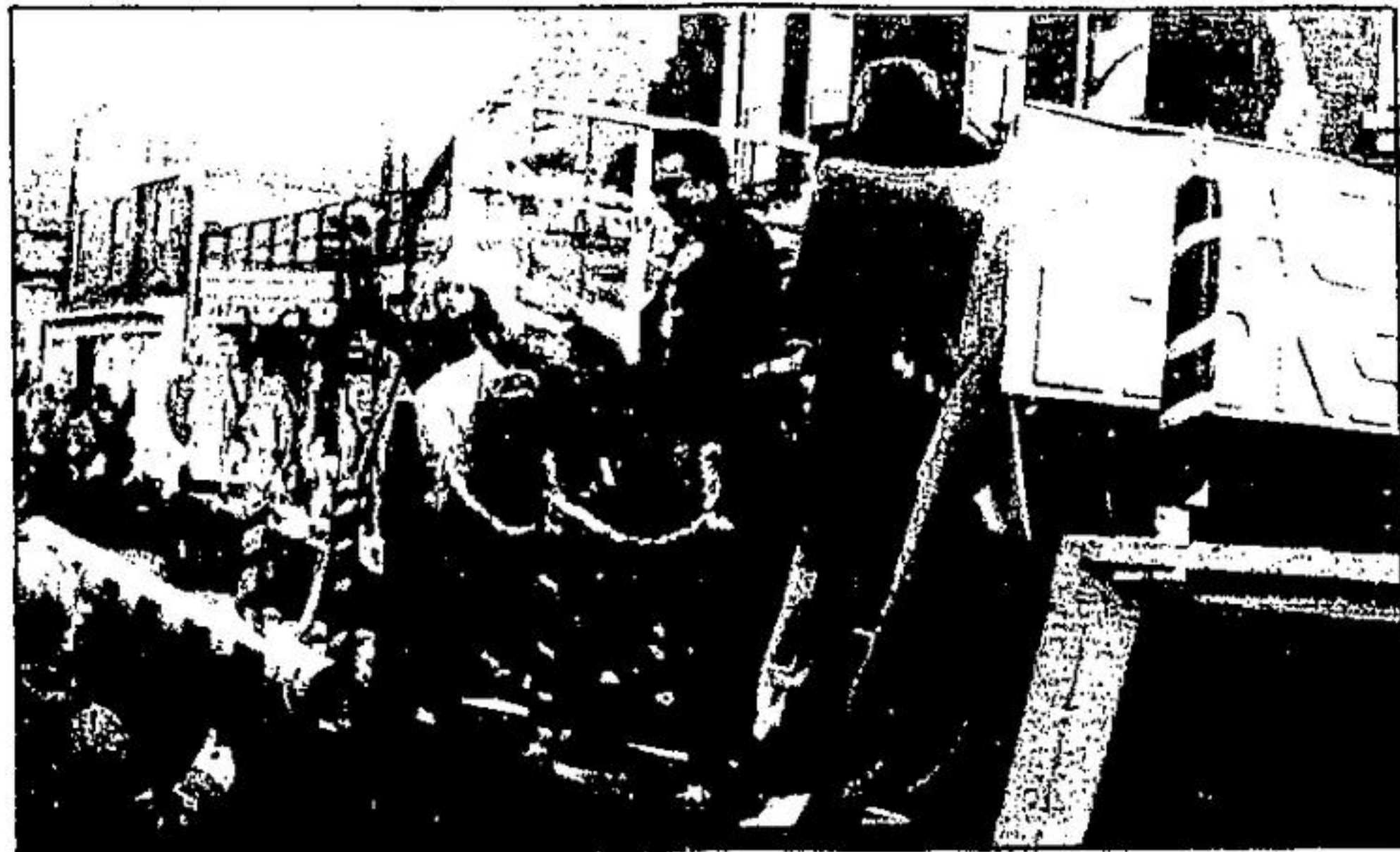
Lions Club celebrates Christmas.