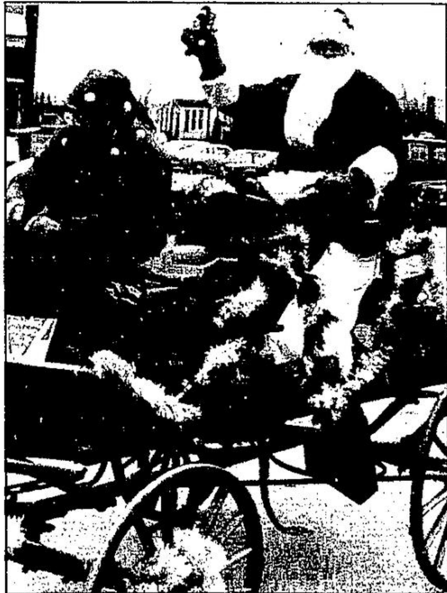
The star of the show.

Those participating in the parade were treated to hot chocolate at the Scout Hall immediately following.