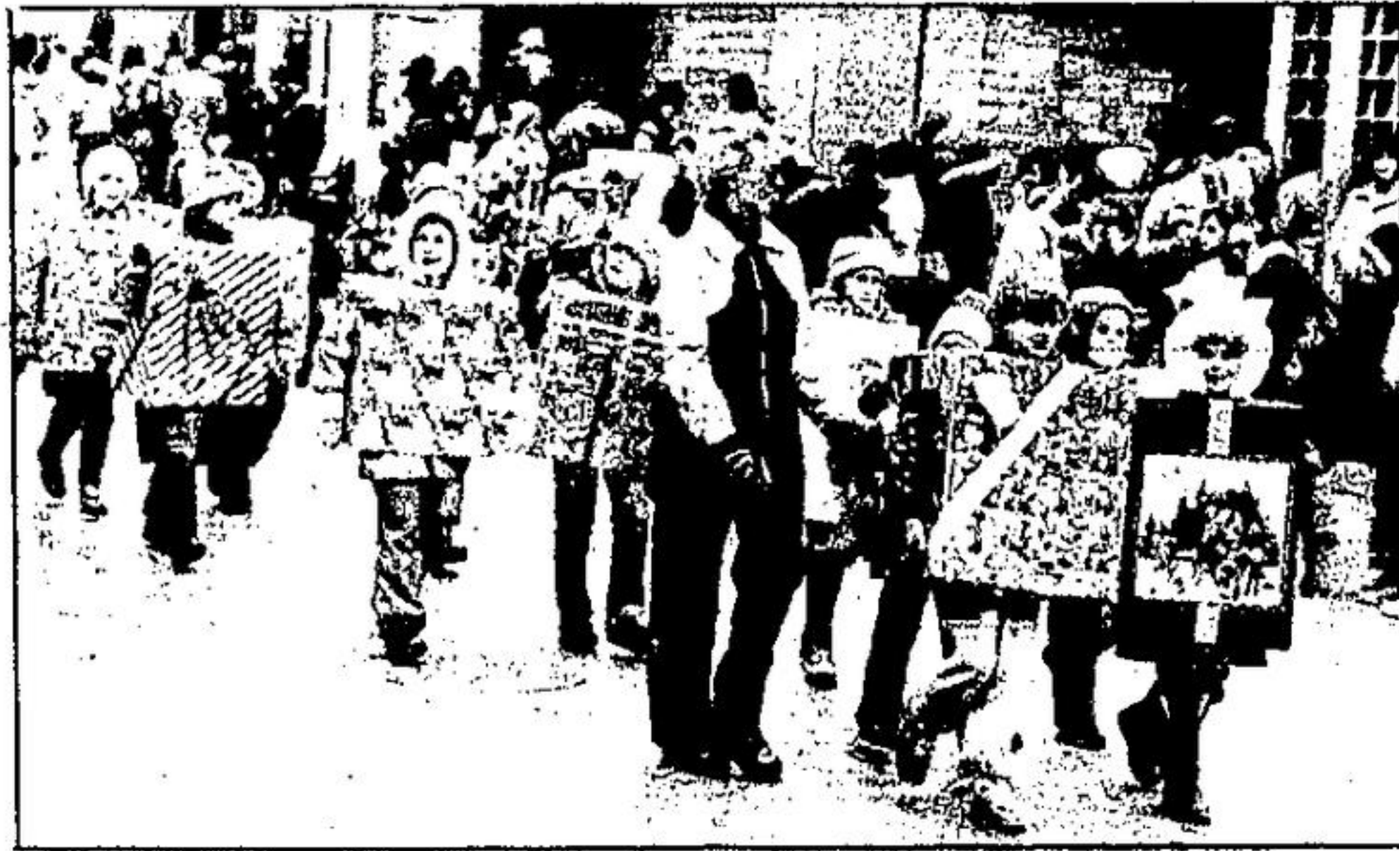
Brownies make great gifts.