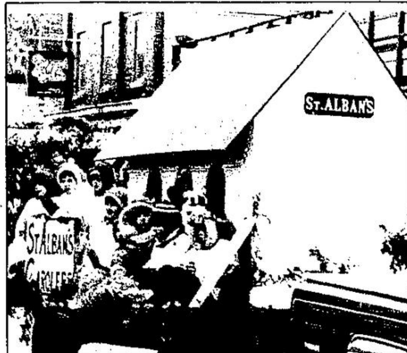
St. Alban's children salute Christmas.

ACTON, ONTARIO, WEDNESDAY, DECEMBER 2, 1981