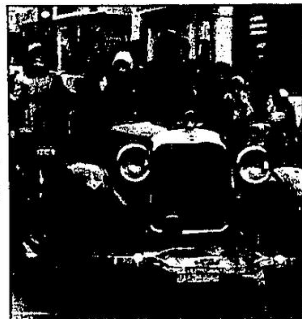
The antique fire truck was an attention grabber.