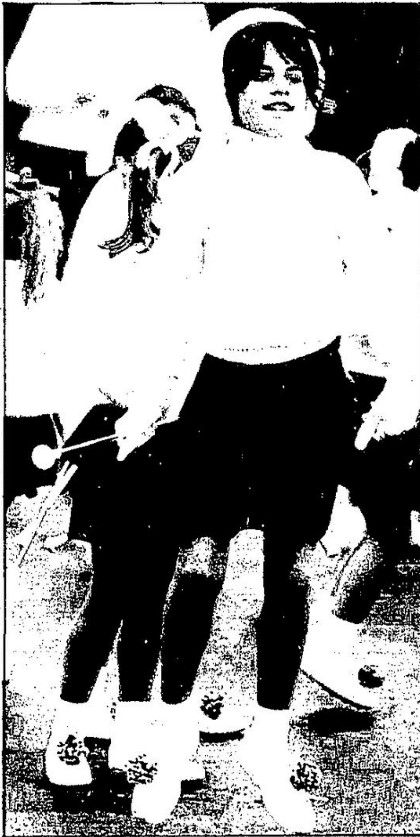
Elkettes baton twirlers marched in the parade.