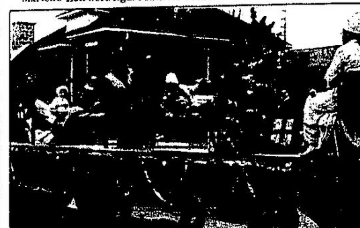
Greetings from the Optimists.