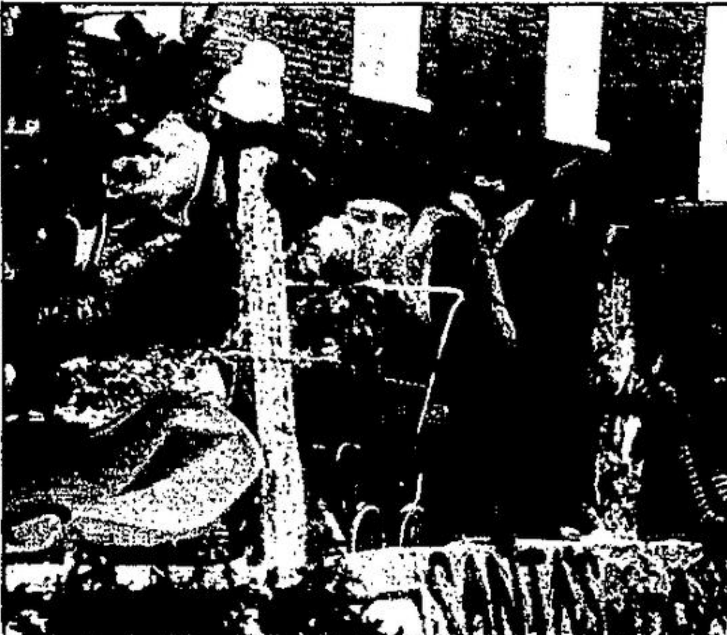
Acton Y's Men's Santa's workshop float.