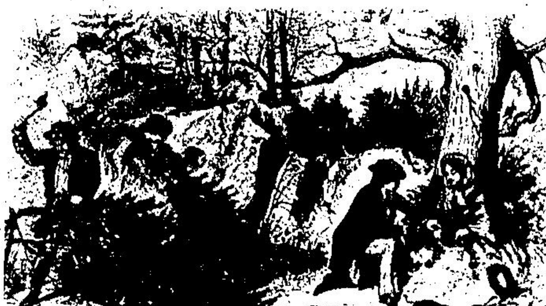
"GATHERING EVERGREENS," an 1858 engraving by Winslow Homer, shows the old-time method of gathering Christmas greens for the home. While the men at left cut down trees—a practice still followed by economically minded Americans—the man and woman to the right weave wreaths of evergreen, possibly laurel, holly or mistletoe.

After all, the evergreen is but a symbol of the presence of life in the darkness of winter, the true meaning of the Christmas celebration.