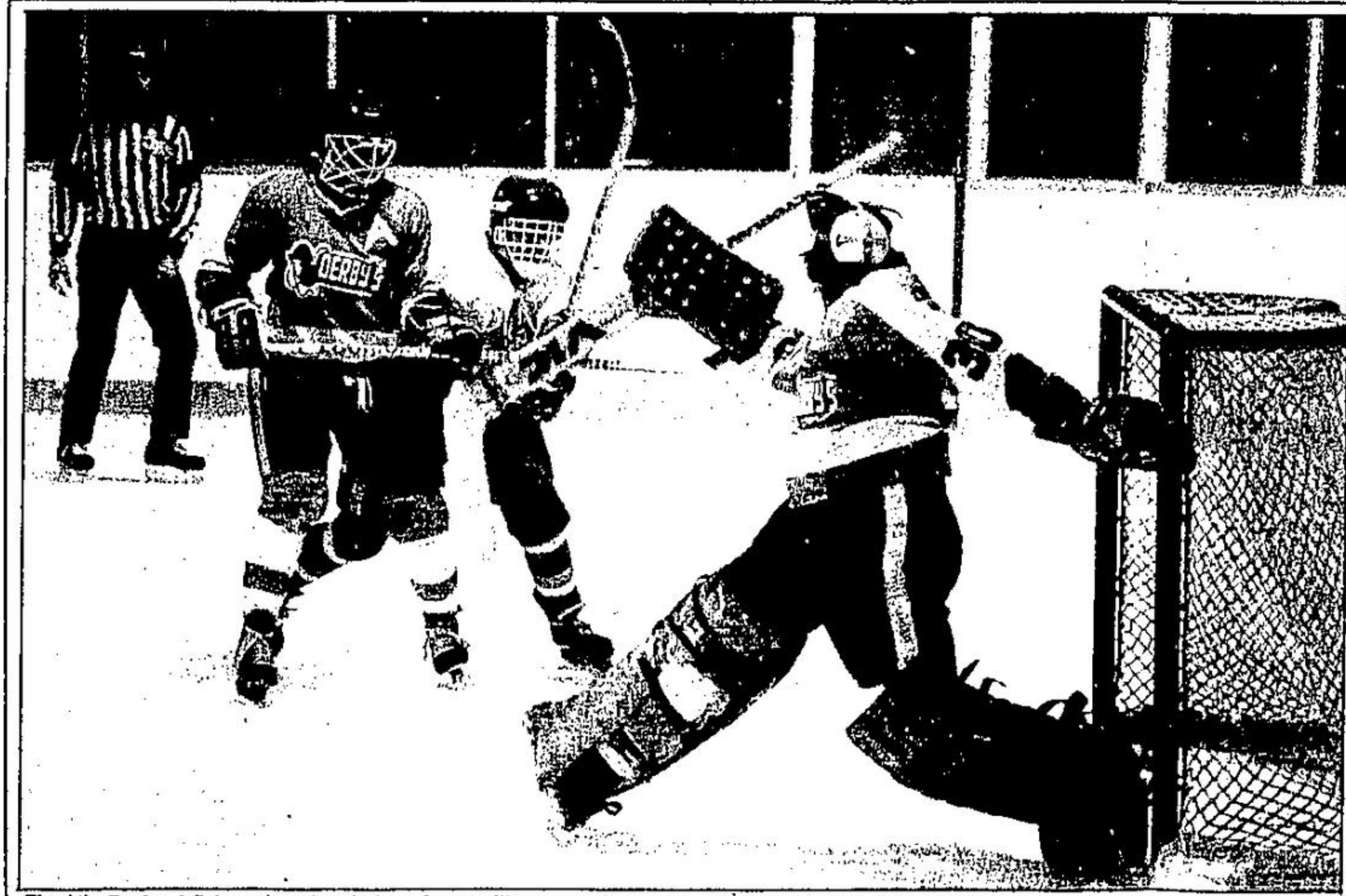
Tip of the Derby. A Sabres player breaks in on Streetsville Derbys netminder in Jr. B. play Friday night. Sabres put in a good performance, but were a little shy on the scoreboard in a 4-1 decision.