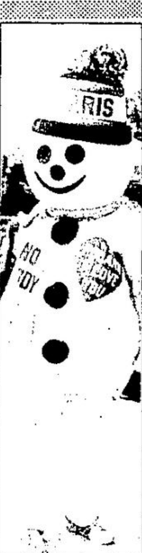
This was one way to keep warm on the weekend.

Your Message Gets Across Better IN WANT ADS