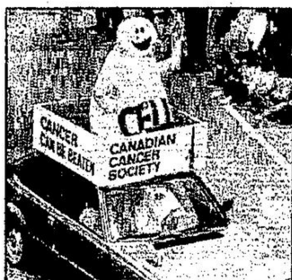
Even Celly, a healthy human cell was in the parade, courtesy of the Canadian Cancer Society.