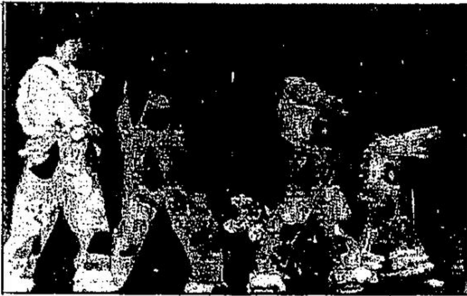
Broadway Brats sang and danced for the audience.