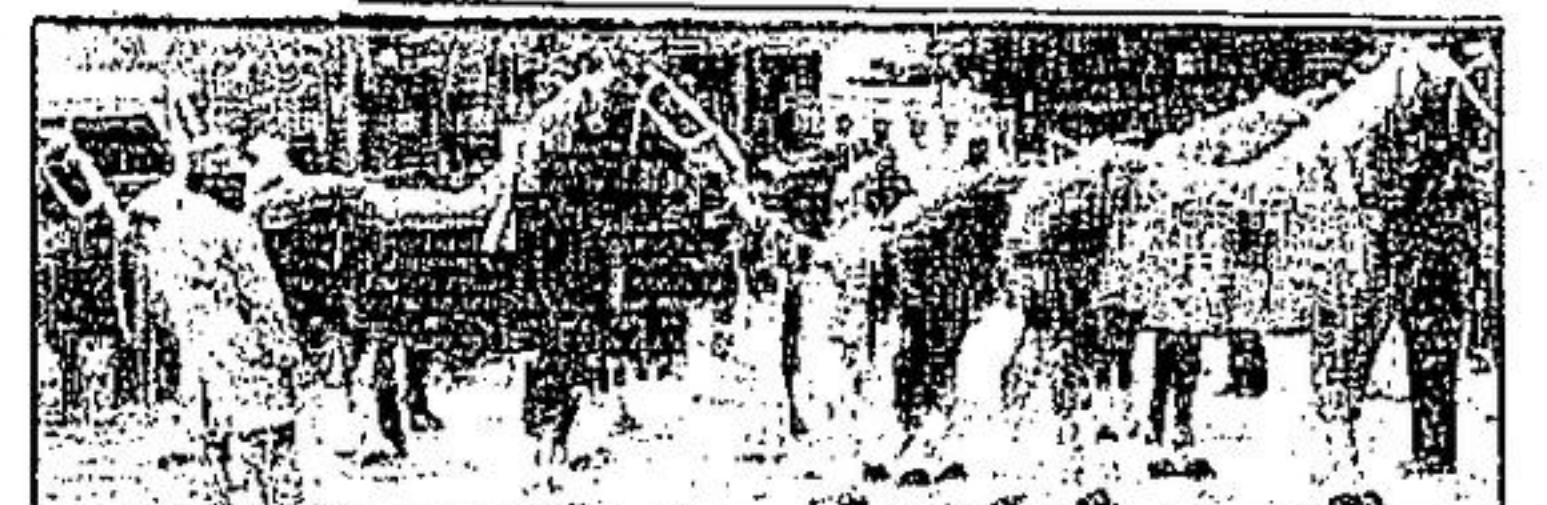
Weightwatchers anonymous would attract some of these big beautiful Belgians in the draft line classes.