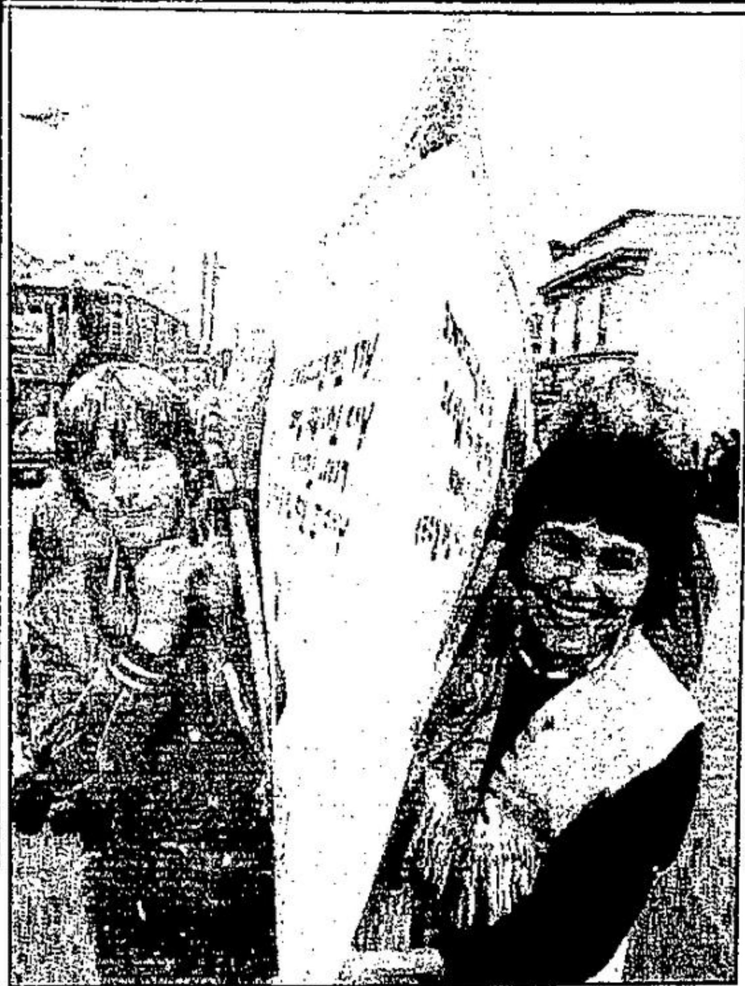
Acton High School Voyaguers portaged down Mill Street Saturday during the parade.