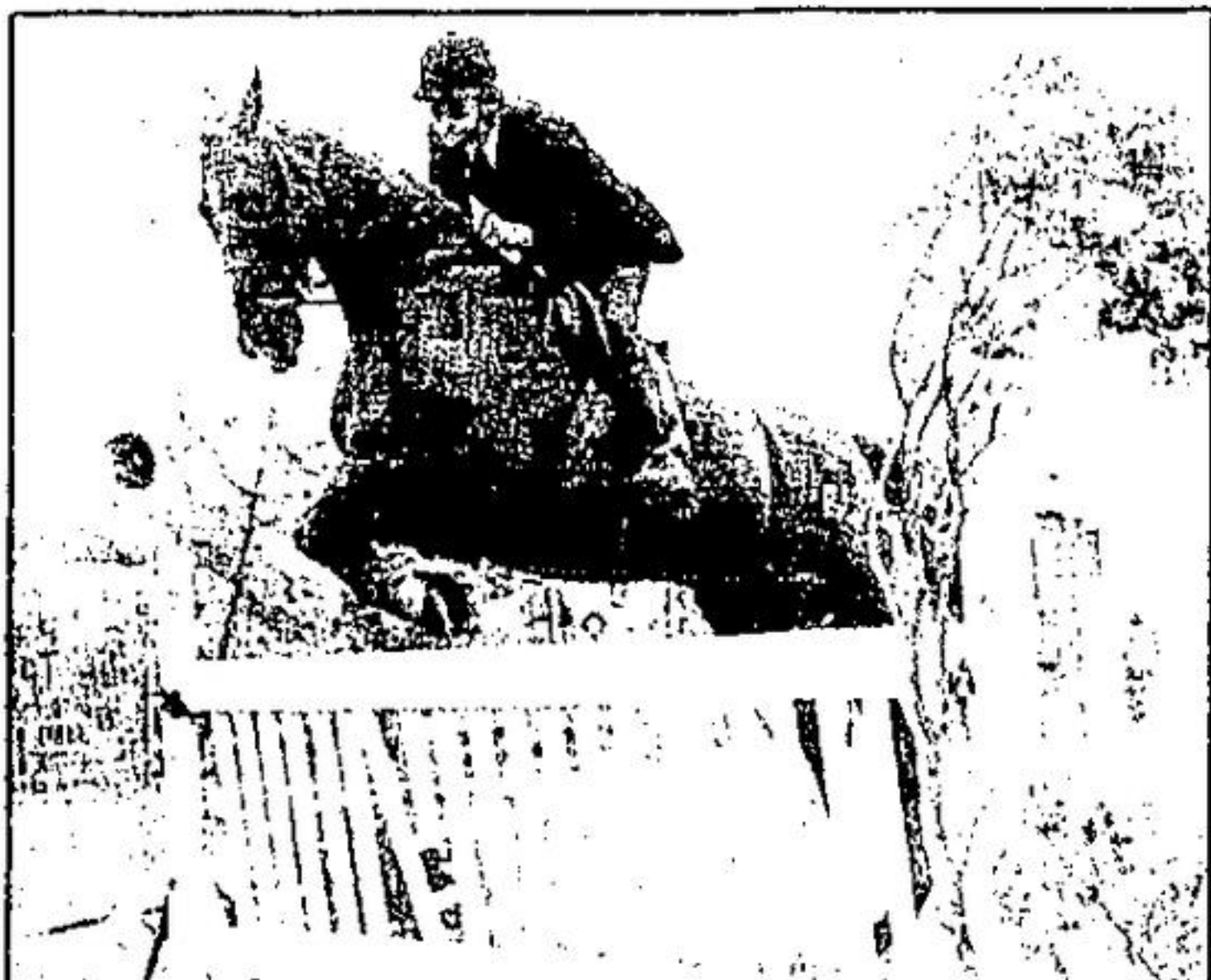
The number was down but the quality was up in English jumping classes according to a fair director.