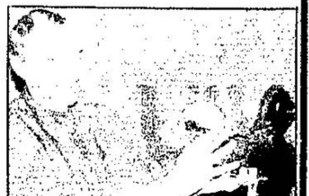
Judge Bill Shrum checks out a white crested black polish bantam in the poultry competition.