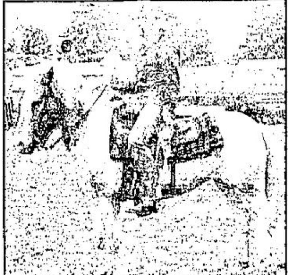
Ponies and kids go together and they did Saturday at the Gymkhana games.