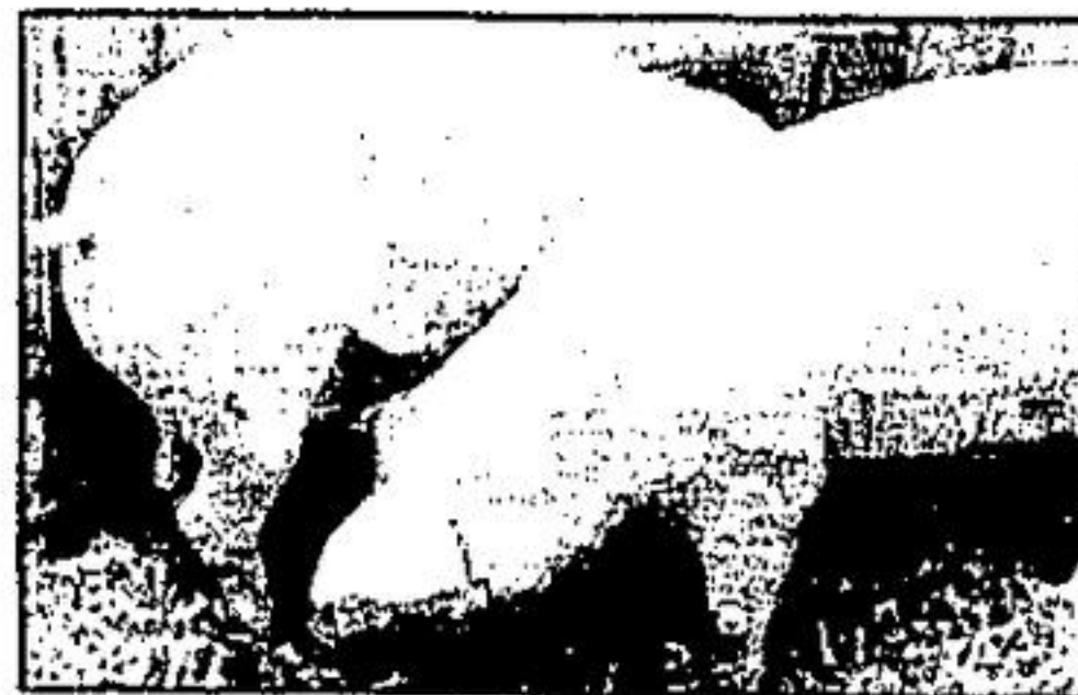
Only a few pigs made it to the fair but they were cute.