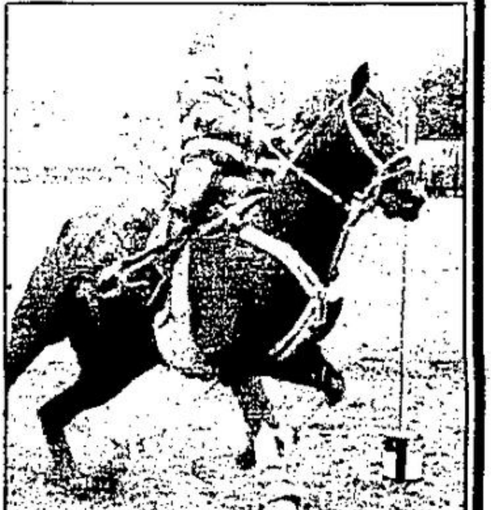
Shelley Hamilton swings her mount round the pivot pole during pole bending races in the western horse show.