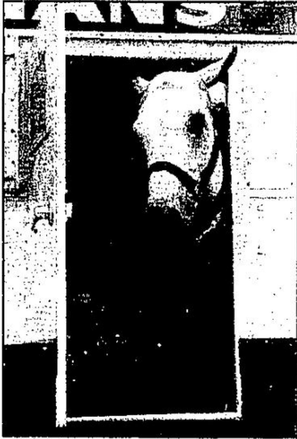
So this is the Acton Fall Fair