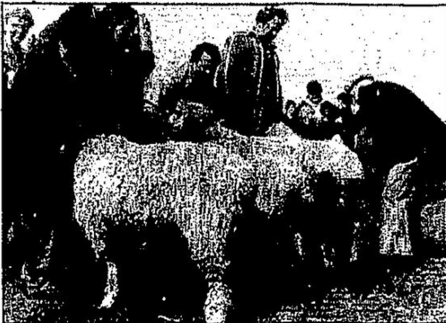
Lincoln yearling rams are judged for type and quality.