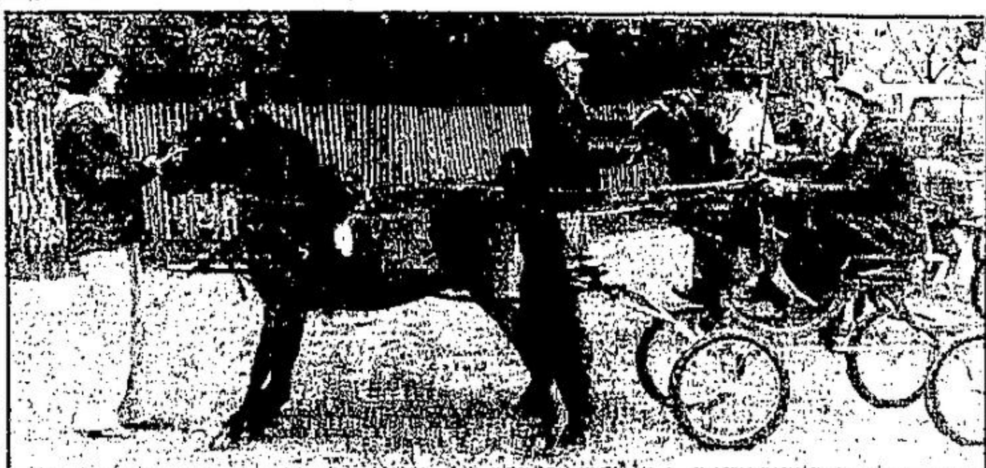
Shetland ponies were all dolled up for Saturday's fine harness classes.