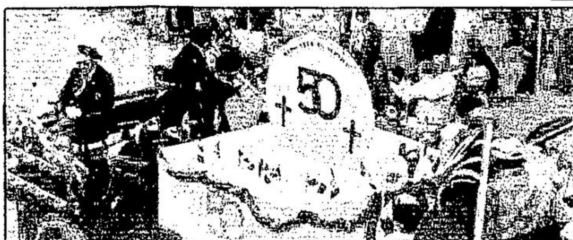
Acton Legion took advantage of their 50th anniversary for the theme of their float.