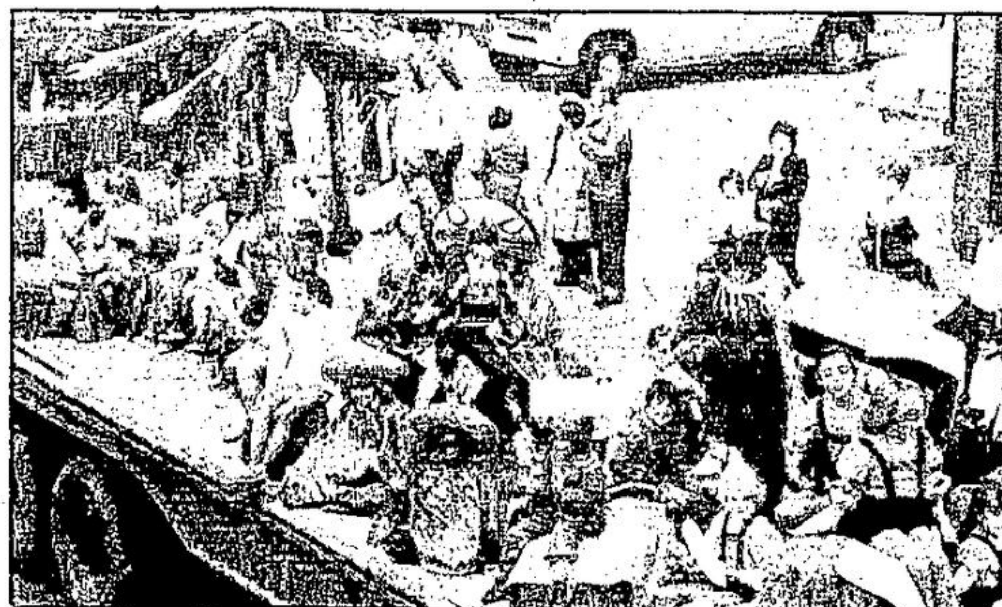
Acton Figure Skating Club rounded up many of their members for their float.