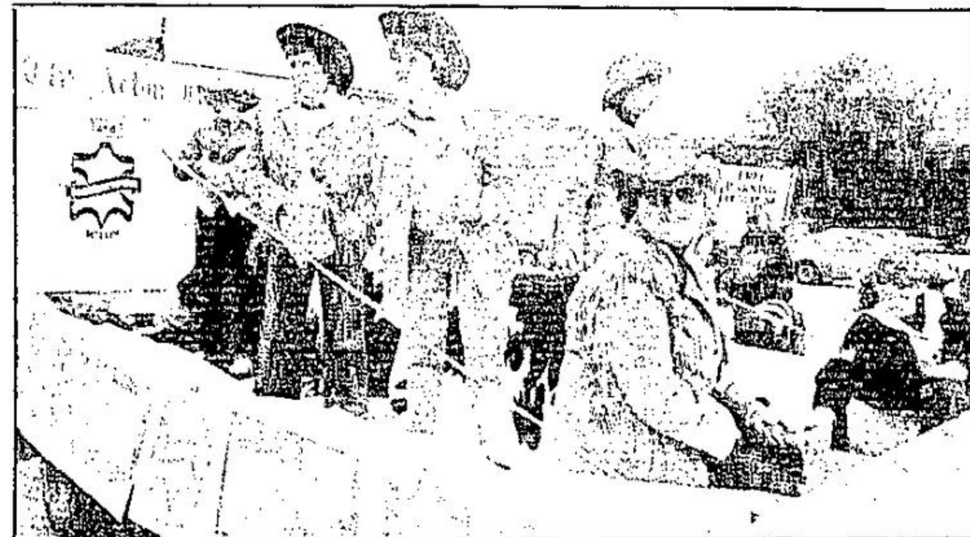
The Acton Free Press and Leathertown jointly sponsored a float to show how both are working together to promote Acton.