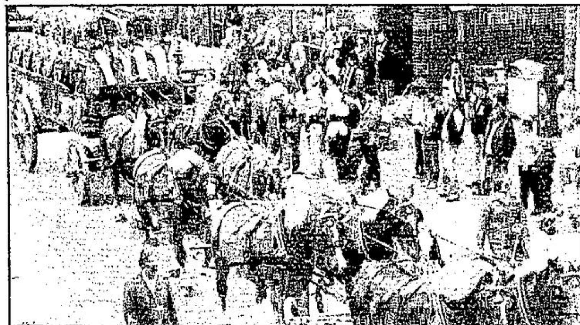
Carlsberg Horses are always a favorite in any parade.