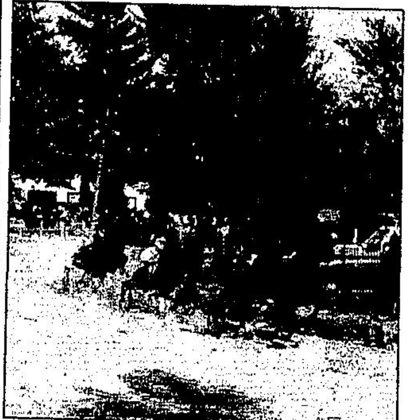
Pacers raced the track in 1948 providing excitement for cheering throngs (well, a small throng, anyway).