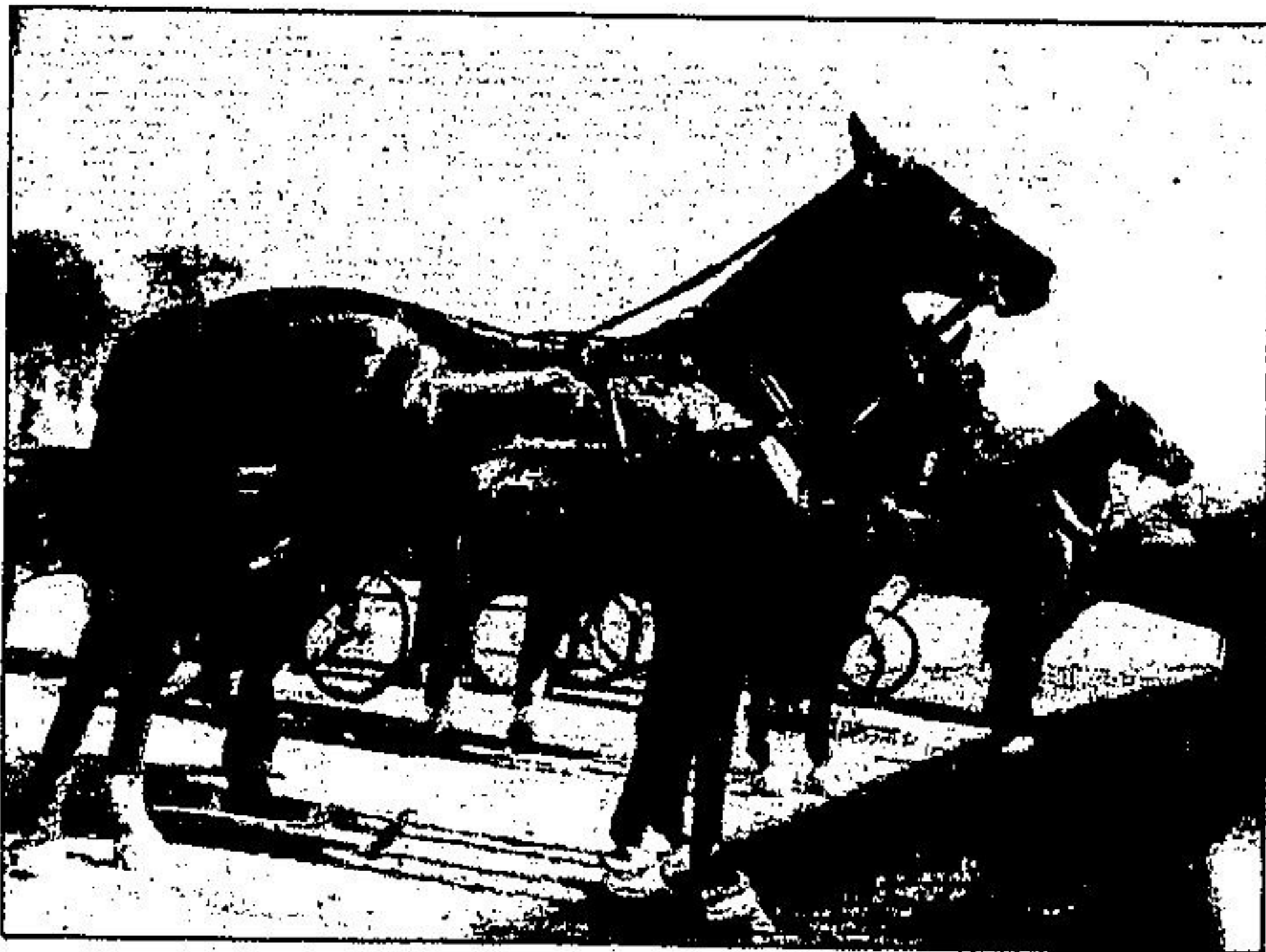
Roadsters were a popular item in 1940 when the fall fair still featured roadster classes. These classes were only dropped a few years ago.