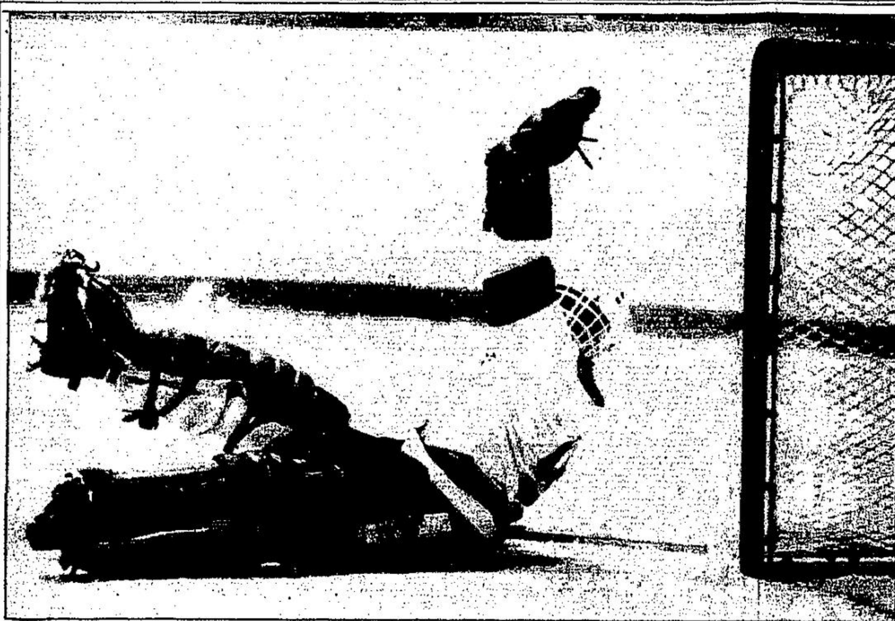
Where'd it go... This net-minder tries to follow the puck blasted over him during a scrimmage Tuesday night in Guelph.