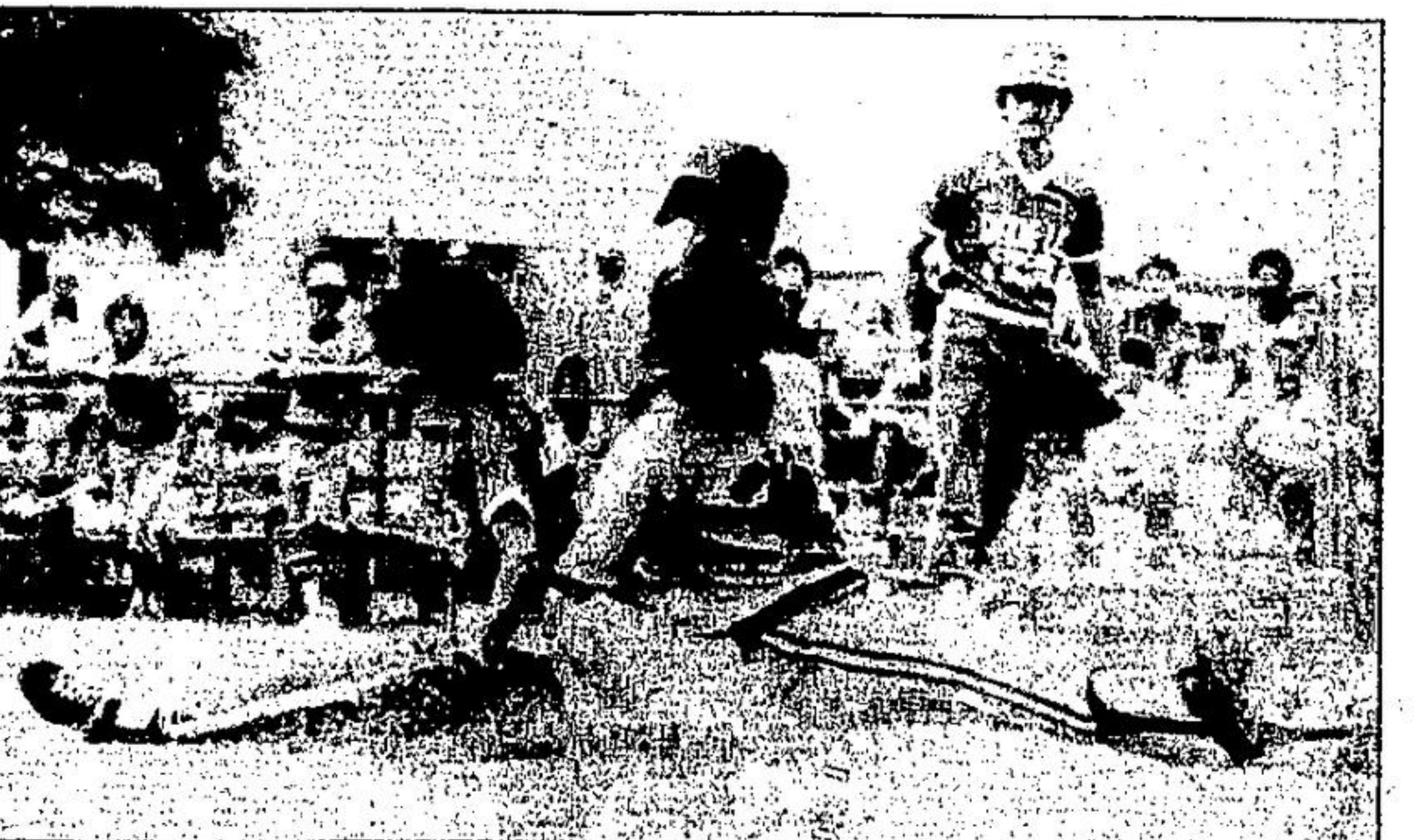
Sitting down on the job... An Orleans baserunner and Lindsay's short-stop both end up in the dirt after a slide to second base.