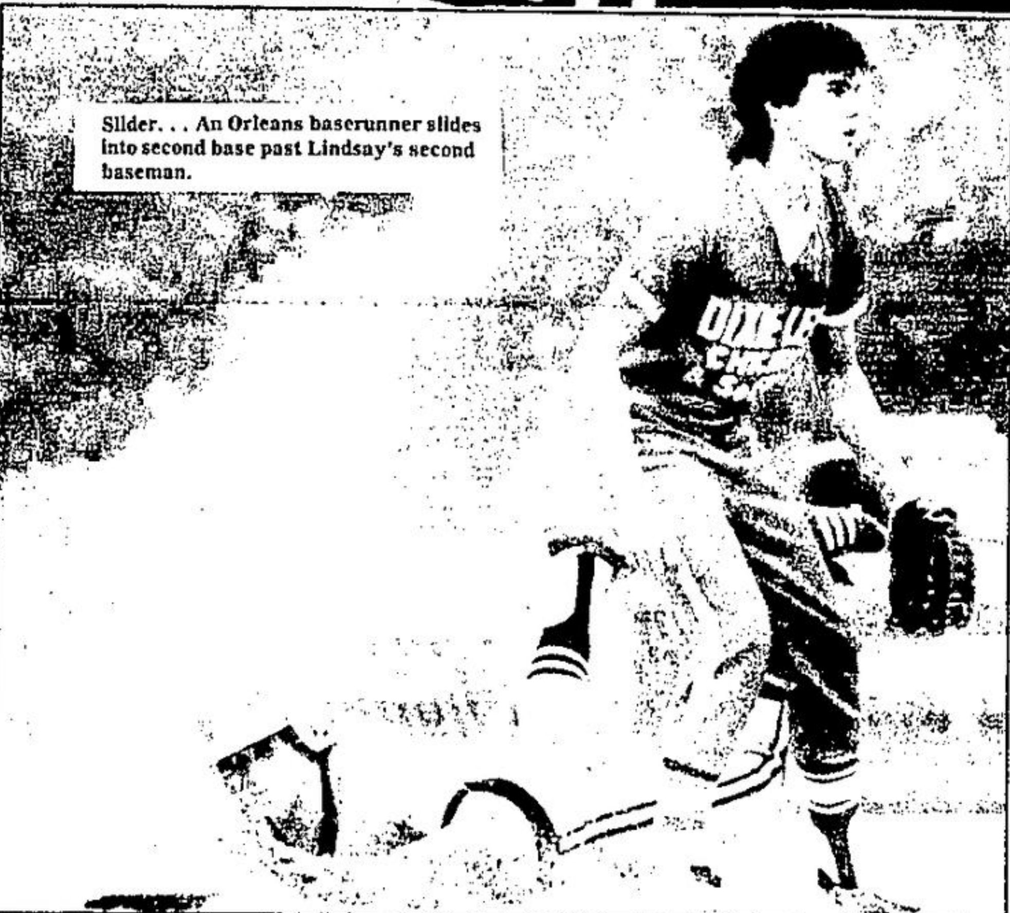
Slider... An Orleans baserunner slides into second base past Lindsay's second baseman.