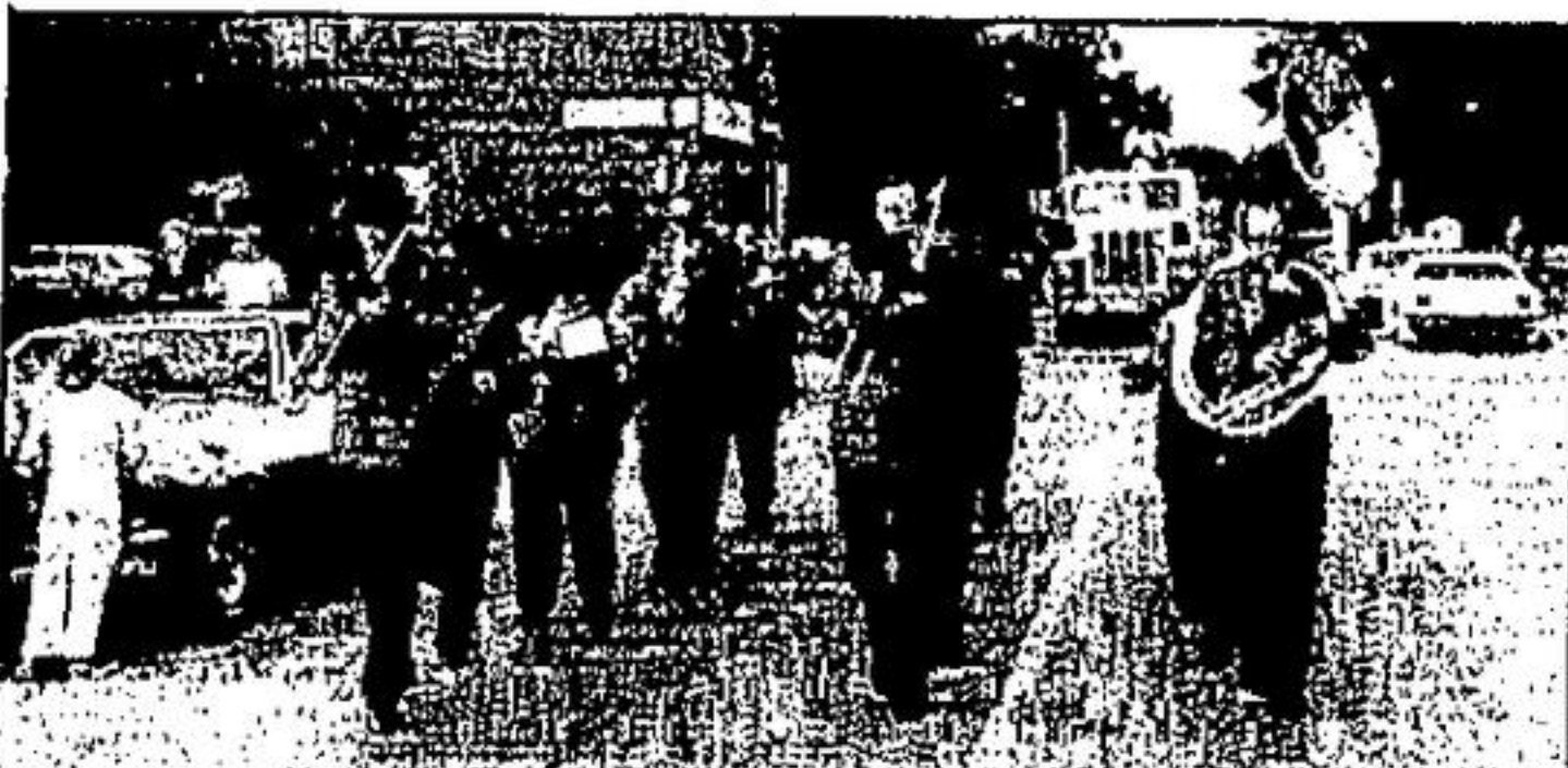
Acton Children's Band provided the only musical entertainment in the parade.