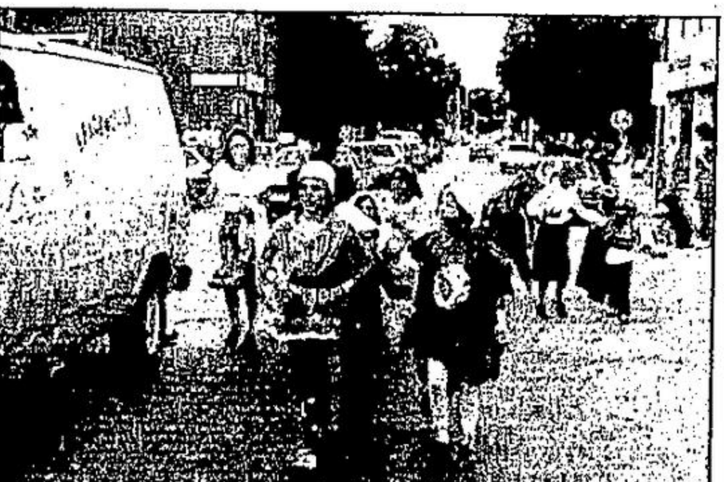
They came from as far away as Mars to see the parade. Playmobile youngsters certainly got into the act.