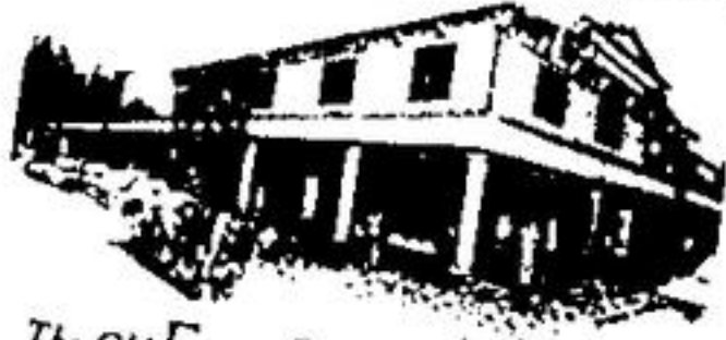
The Old Free Press Building

Lots of parking Covered walk Bright pleasant surroundings Visit the friendly Merchants at Acton Mews