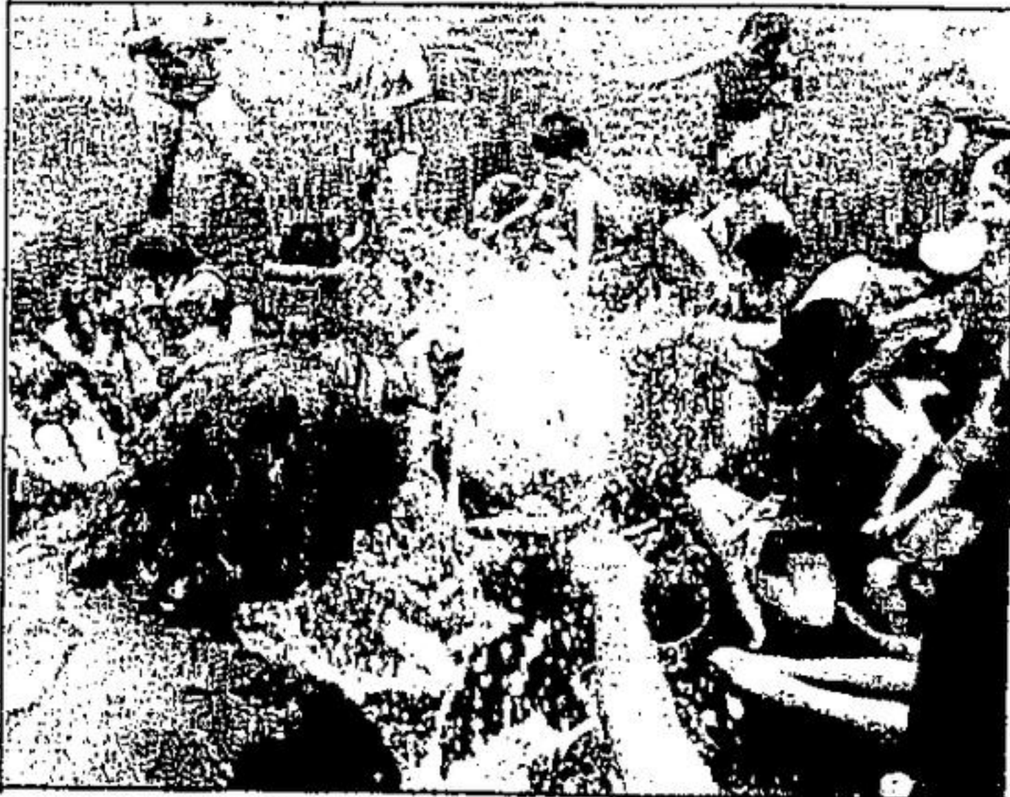
They're all wet. A group of Acton and Georgetown kids get pelted with water balloons during the fun at Mad camp last week.

He said he was certain all trustees would say their goal remains to open the school next spring and nothing has changed to scrap that timetable.