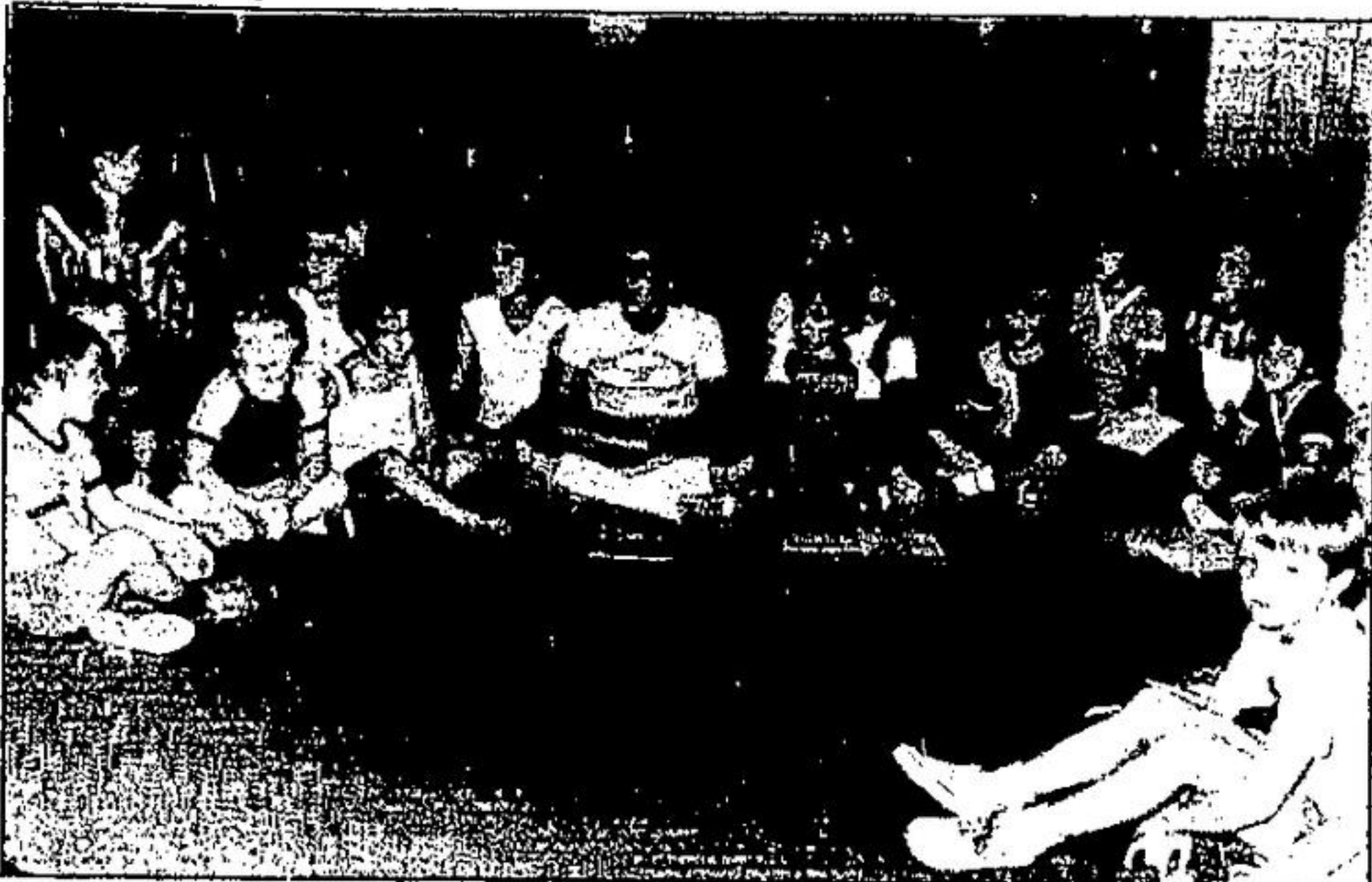
Youngsters ranging from pre-schoolers to young teenagers have been attending the Vacation Bible School at Knox Presbyterian Church this past week. Sing alongs, crafts, and story hours keep everyone busy. The school continues until Friday, and runs from 10 a.m. to 2 p.m.