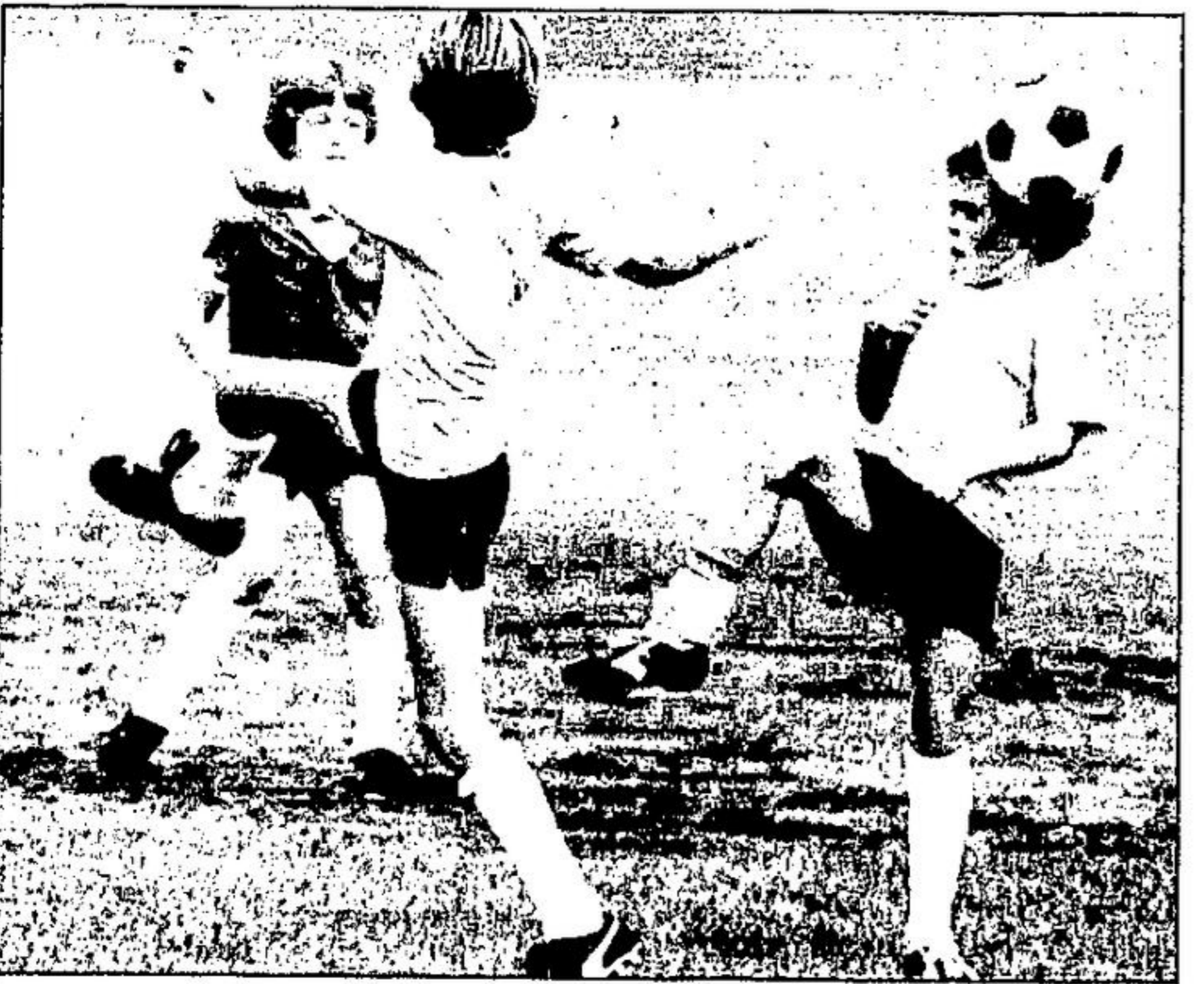
Heads up. A pair of Cougars players try high kicks during an atom game against Leopards. Leopards won the game 4-2.