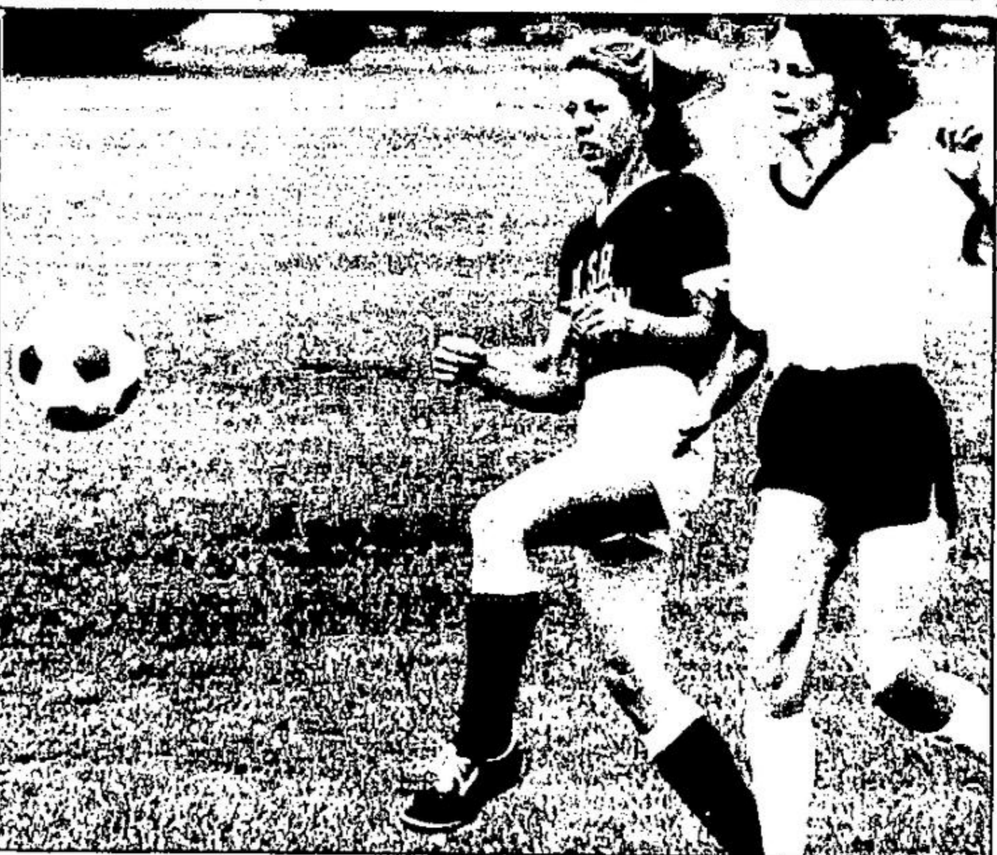
A Milton player boots the ball past her Acton opponent during a ladies senior soccer game at M.Z. Bennett Public School Monday night.