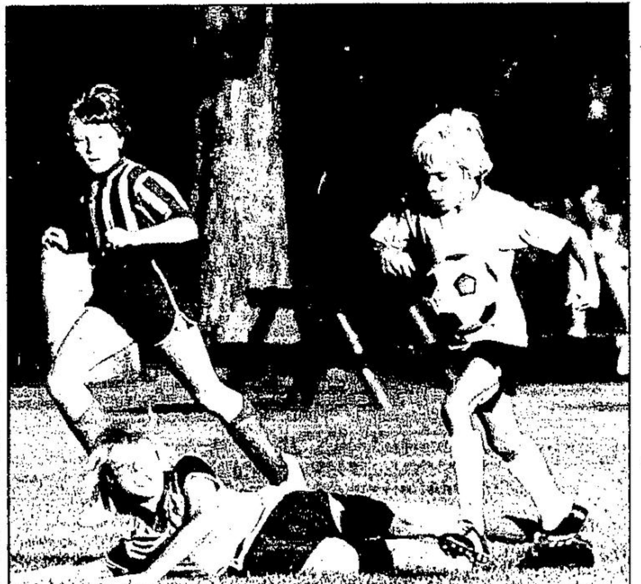
A Cougar brings the ball around fallen Rockwood goaltender in Monday's atom house league soccer action. Rockwood won the game 3-1.