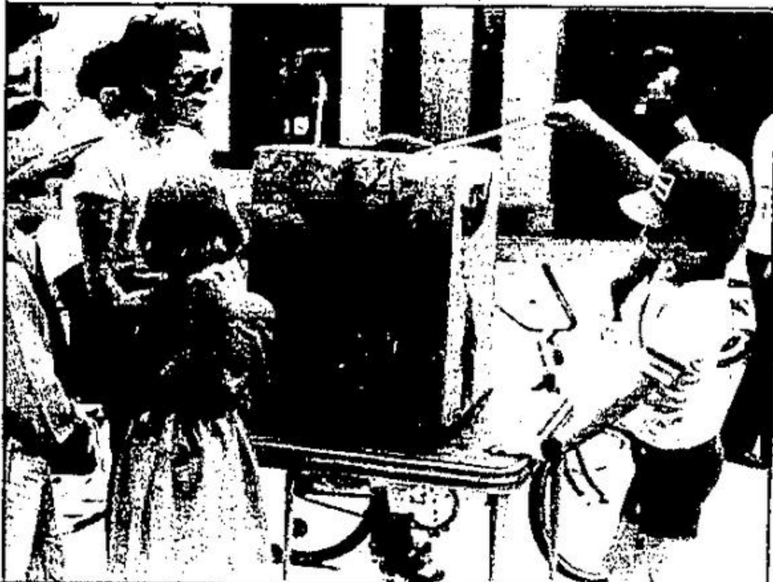
Peggy Ancker's Blue won biggest dog, best trick and shortest tail.