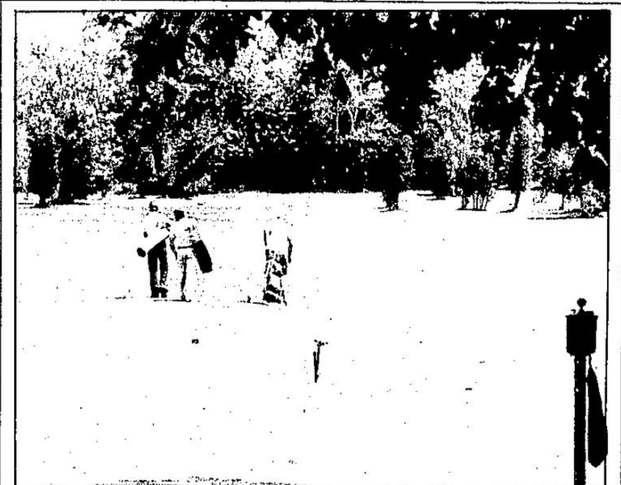
Acton Meadows is just one of the three golf courses to test local swinger's skills. A complete golfing guide to local links is on B2.

Monday, June 29, the Cougars face Rockwood at AHS, the Wolves and Leopards meet at Prospect Park and Rockwood B's take on Eramosa.