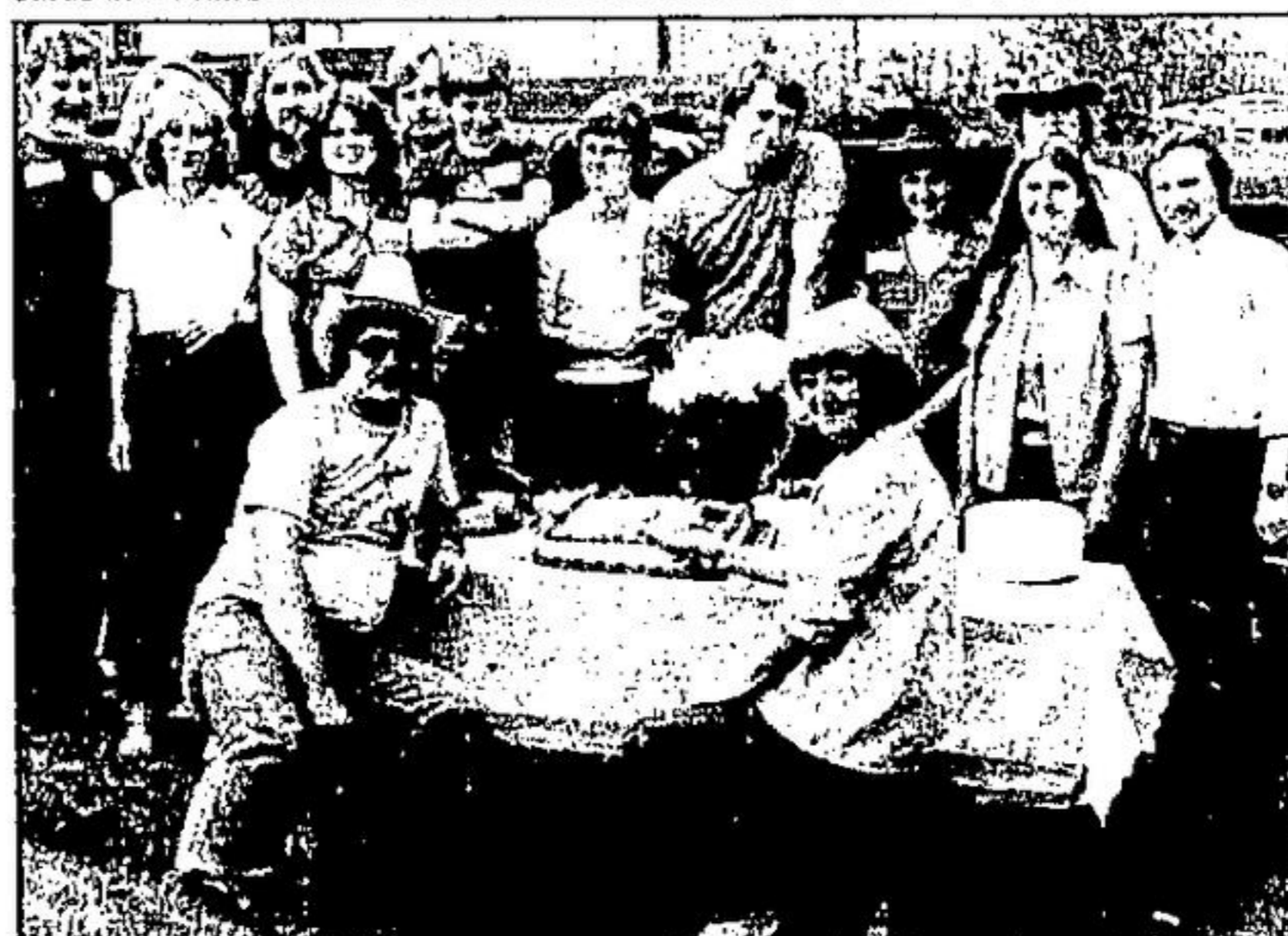
Some neighbors on Greenore Cres. celebrated their 5th annual barbecue Saturday night.