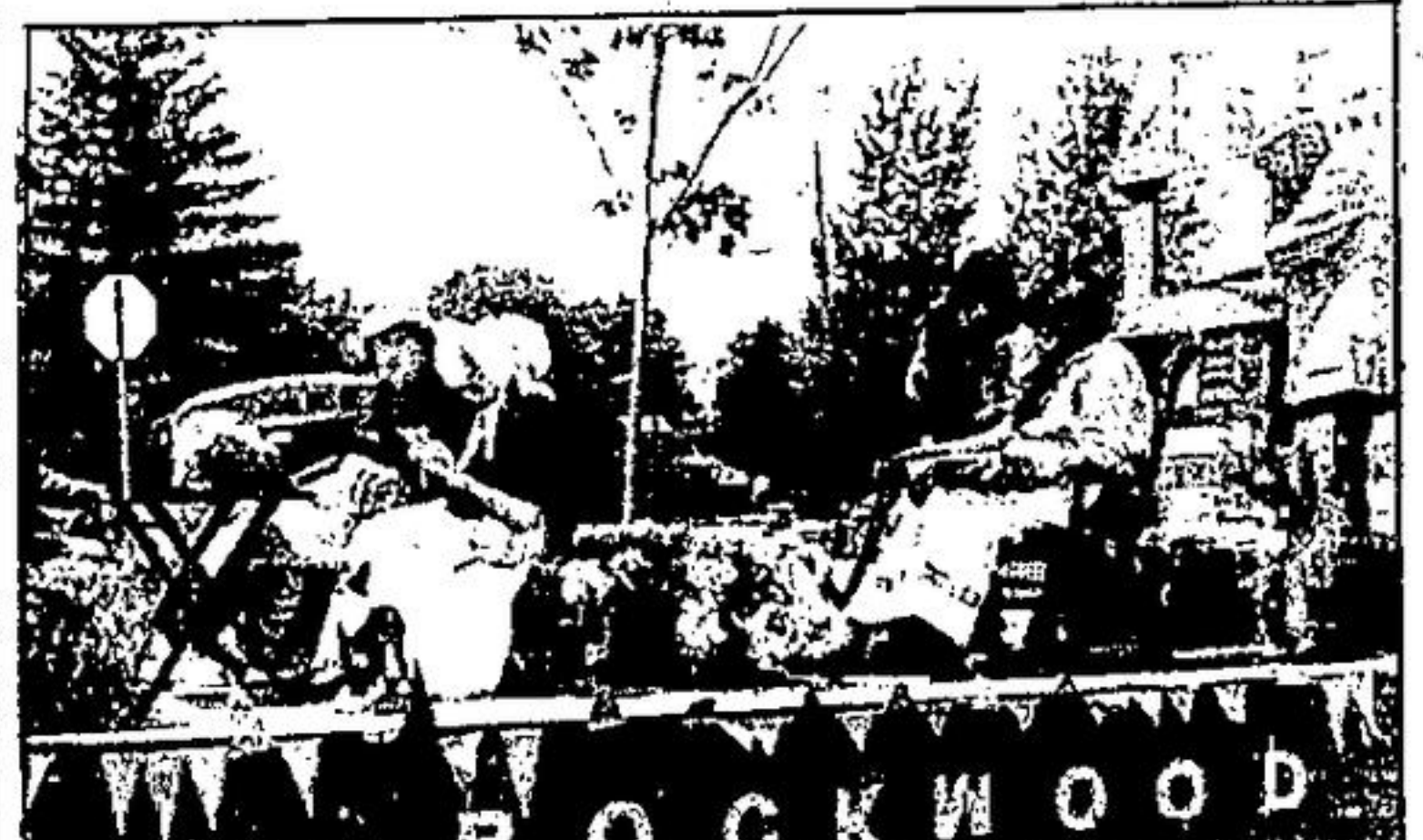
Rockwood Sunshine Club float drew applause during Rockwood Pioneer Day Parade Saturday. The event attracted hundreds of spectators and participants from as far away as London, Ontario.