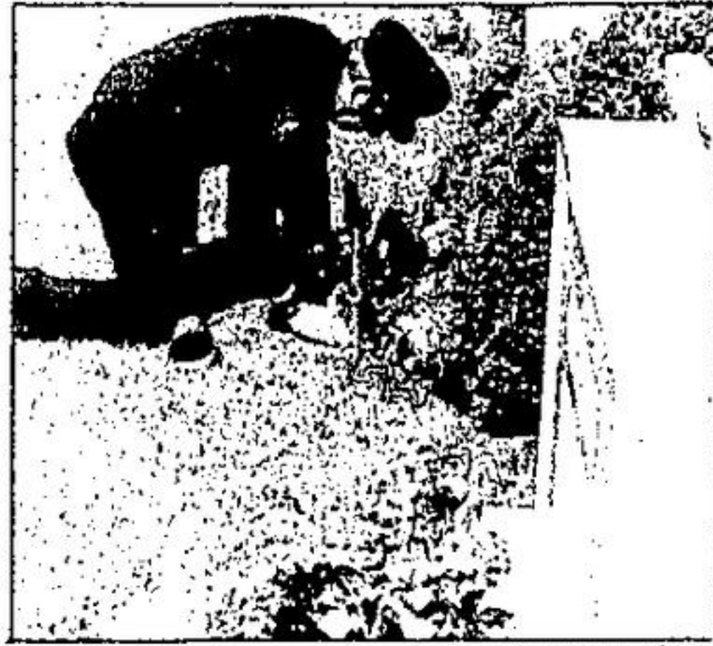
Bern Van Fleet places a geranium at the grave of a former firefighter.