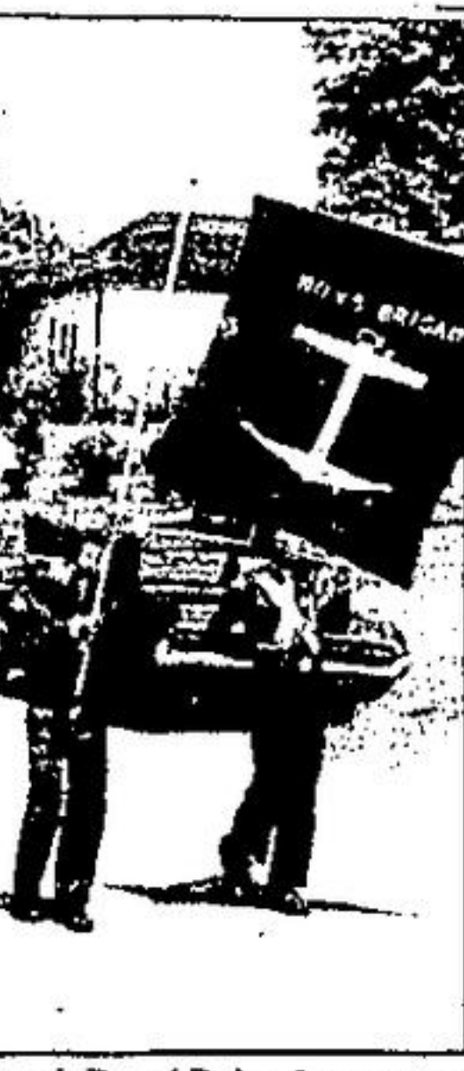
The Knox Presbyterian Church Boys' Brigade marched in the Decoration Day parade.