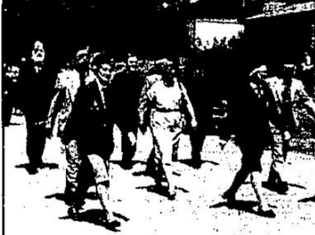
Legion Ladies' Auxiliary members, Halton Hills councillors and local clergymen participated in the parade and service.