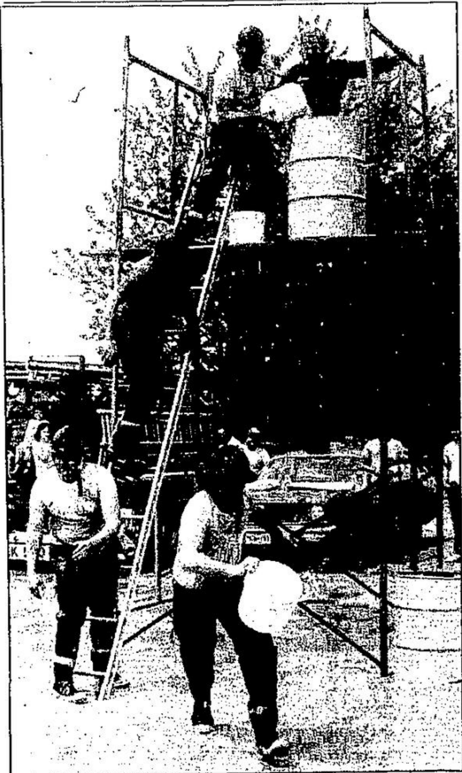
The Acton Firefighters men's team in action in the bucket races Saturday at Prospect Park.